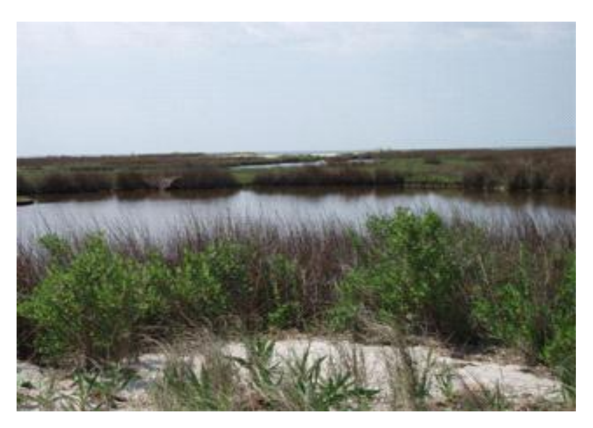
Parkers Marsh Wildlife Refuge with the Bay in the distance

Our Day 3 open water paddle to Smith and Mackhorn Islands departed from the Eastern Shore of VA National Wildlife Refuge and ran parallel to Fisherman Island Wildlife Refuge. We landed on Smith with its Cape Charles Lighthouse and took a long walk along the beach on the Atlantic side. The beach served-up many creatures from the ocean deep including large conk shells (inhabited and vacated), sand dollars, a strange looking fish, lots of shells (no tourists walk here), and a deceased dolphin. From the beach one could look across the Atlantic to the Cape Henry Lighthouse. On returning to our kayaks we saw an oyster catcher status then had lunch and waited for low tide to paddle north to Mackhorn Island. On the way we saw large white semi-soft structures in Magothy Bay on the bottom in different shapes. No one knew what they were — whether plant or animal. After exploring the southern end of Mackhorn and seeing eagles once again we returned past Skidmore and Raccoon Islands to the put-in. Along the way we spied-on a red fox apparently stalking several large white egrets fishing near the water or their eggs.