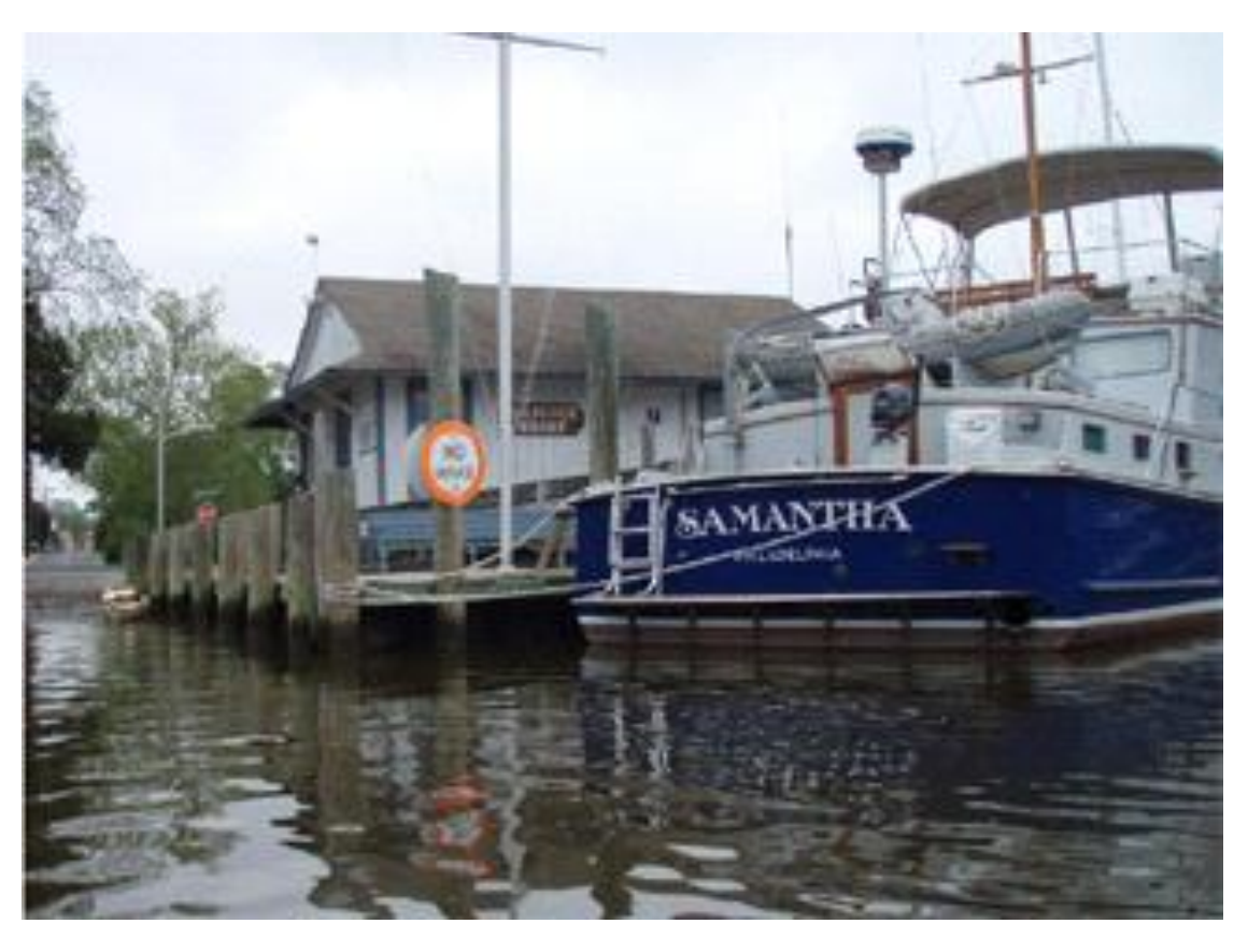
Wharf at Onancock VA (founded 1680)

Ron and Greg arrived late morning on Day 1 and met by chance in Cape Charles a terminus for the former ferry service that ran the mouth of the Bay to mainland Virginia and back and before construction of the present 20-mile bridge-tunnel. We checked-out the town, the local kayak outfitter, the burgers at an Irish pub, and then headed for the park to setup camp. When the others did not arrive after a period of waiting we went for a 10 mile paddle. We launched from the park and paddled north hugging the shore to cut a brisk northeastern wind to undeveloped Elliot's Creek. We explored there in a grand silence that was in sharp contrast to the windy Bay. The eastern shore of VA is known for its many varieties of birds. We were not disappointed as we saw eagles, pelicans, snowy, herons, loons, and large aggregates of mystery shore birds. On returning to camp Andy, Dale and Bill greeted us.