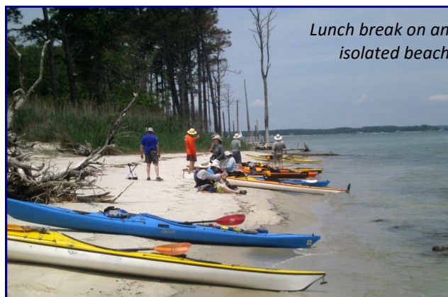
Lunch break on an isolated beach

Note: CPA does not rent, sell, or provide boats and equipment.