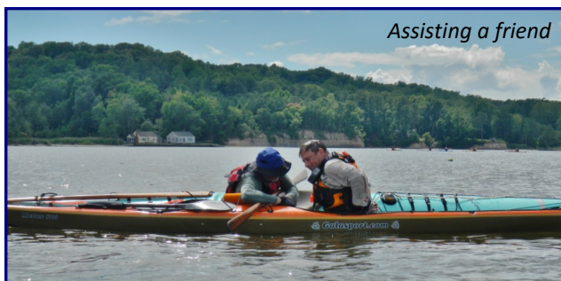
Assisting a friend

CPA offers a wide variety of member-led sea kayaking trips. Club paddles include day trips and multi day car or kayak camping trips. Explore the Chesapeake Bay and surrounding waters. You can find others to paddle with through the CPA Forum topic "Peer Paddles".