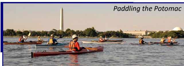
Paddling the Potomac

Although not official CPA events, many CPA members volunteer to organize and provide safety support for charitable swim events, demo days, and other on-water activities in the local area