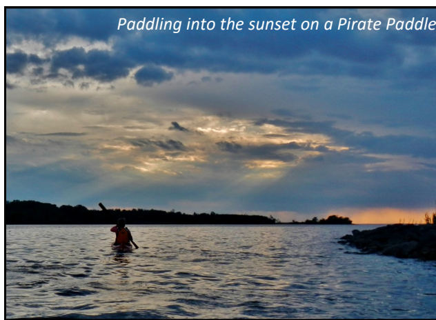
Paddling into the sunset on a Pirate Paddle

Mix and mingle with fellow paddlers in the CPA Online Forums and Facebook. Talk about kayaking events, paddling trips, buy, sell or swap kayaking gear, and much, much more.