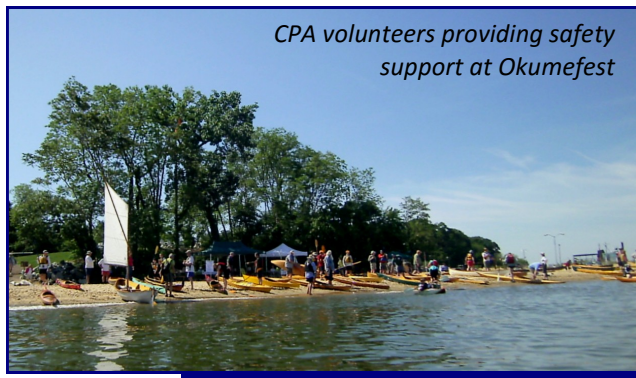
CPA volunteers providing safety support at Okumefest