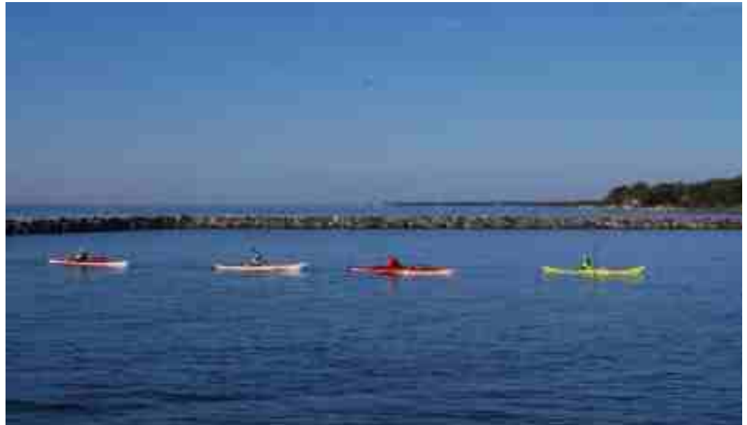
The KIP series is a team effort. Paddling together once a month beginning in April, participants improve skills and endurance as they approach the goal of circumnavigating Kent Island in September.