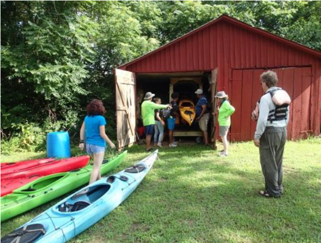
Figure 7 Preparing kayaks for campers