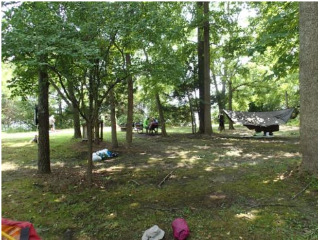
Figure 6 Our camp at Maxwell Hall; Gary Trotter and Sophie Troy

So, on the 4 th day of our kayak camper, we were headed back UP the Patuxent to Spice Creek, the campsite we'd used the prior night. Thus our mileage was going to be about 58 miles, plus the 6 or so miles we did on Hall Creek (rm 52-rm23 = 29 miles x 2 + 6 = 64 miles in total) and we were