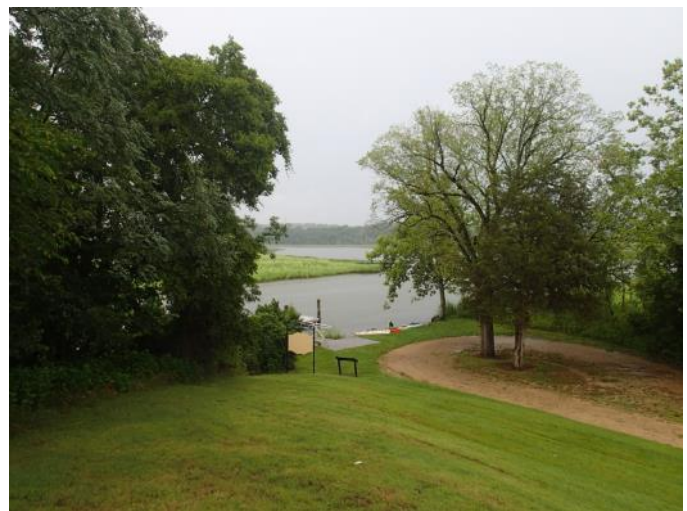
Figure 3 The view from the porch; Mount Calvert is now also an official launch

the expanse of Jug Bay. Our campsite for the night is nestled on the east shore of Jug Bay at Emory Landing (rm 41a), the second Anne Arundel County paddle-in campsite on the river. Part of the Jug Bay Farm Preserve, this entire area is now an Anne Arundel County park (see https://jugbay.org/jug-bay-wetlands-sanctuary-properties/ ), but there is no kayak launch here at present.