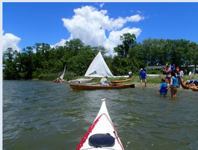
CPA Safety Boating at the CLC Big Little Boat Festival on May 30