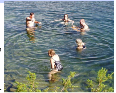
Swim time in Rochester Bay, Sugar Island

There was even a swanky composting toilet over near the HQ. We were not the only ones on Sugar Island, and shared the muddy paths with an energetic young family and several other groups of paddlers. Sugar is one of a group of islands known as the Lake Fleet Islands, and we could easily paddle to the Admiralty Islands, Navy Islands, and down into the American Narrows from there, so it could be the base for an entire week. Sugar Island costs $7 per night for ACA members, and $15 for nonmembers (so join!). You can rent platforms and cabins there, as well.