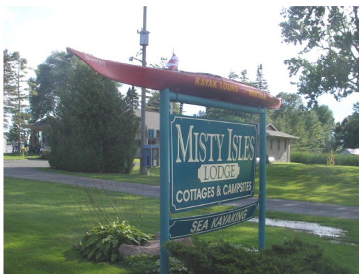
Misty Isles Resort

FOUR CAMPS: We stayed at four different camps over the week, a situation we recognized as less than ideal, necessitated by being late with our reservations (camping fills up quickly when Summer is only 2 months long!). Each camp had pros and cons.