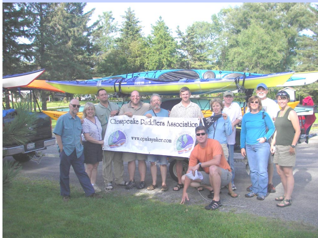
Thousand Island Trippers and the Trailer