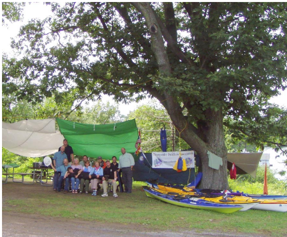
CPA HQ at Keewaydin State Park

known as the Lake Fleet Islands, and we could easily paddle to the Admiralty Islands, Navy Islands, and down into the American Narrows from there, so it could be the base for an entire week. Sugar Island costs $7 per night for ACA members, and $15 for nonmembers (so join!). You can rent platforms and cabins there, as well.