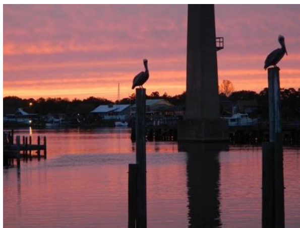
Florida pelicans near Big Lagoon State Park.