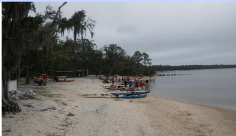
Blue Angel Recreation Area.

The following morning conditions were not much changed, so we had another day of land shuttles. This time we relished the luxury of a rock-star bus instead of the hard floor of a U-Haul. It did not feel like a second lost day, however, because many of us chose to launch in the afternoon to explore the more sheltered areas of Big Lagoon State Park https://www.floridastateparks.org/parks-and-