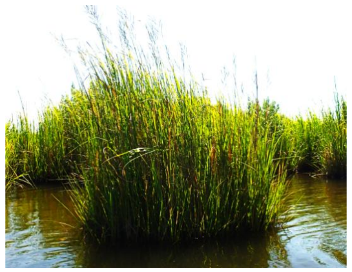
Knotted grass as a "bread crumb" on Muddy Hole Creek

knot it them on the side I needed to turn to, and bent this out over the water. I marked three (and should have done one more), and they worked very well...except that I got a little too