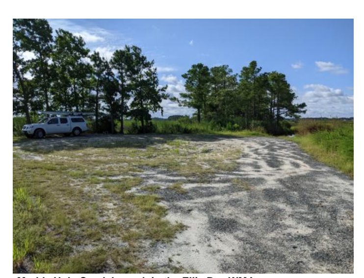
Muddy Hole Creek Launch in the Ellis Bay WMA