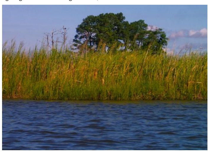
The hammock of trees that saved my bacon

launch sites and nearly 70 paddle-in camping locations throughout the Bay region. While I've picked up most of these locations from published sources, I find some of them by just going out and looking around, like this one.