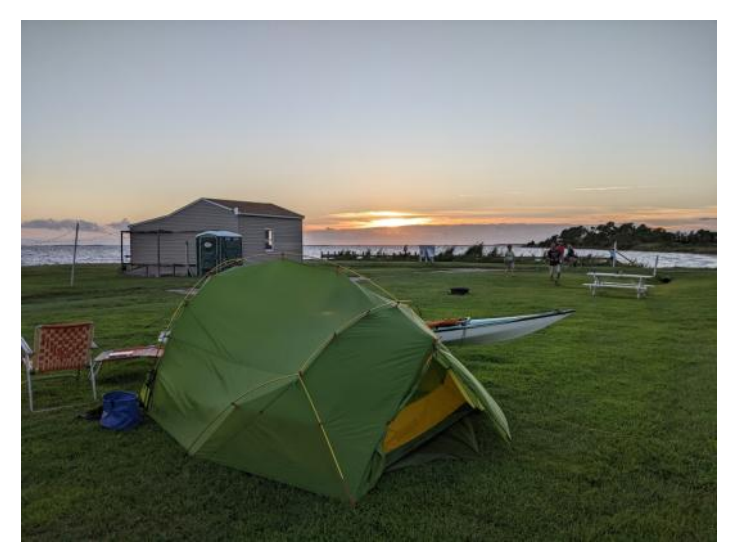
Beach camp at Roaring Point Campground

It is now marked on the <u>Chesapeake Bay Water Access And Paddle-In Campsite Guide (interactive map, Chesapeake Bay Region)</u> on the CPA website, along with nearly 900 other