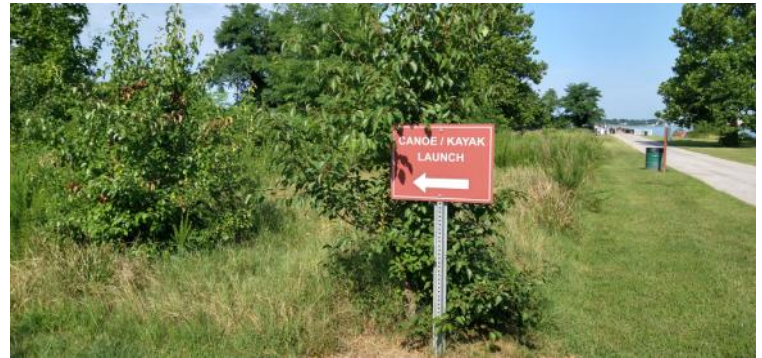
Sign for the new “pocket-change” launch at Fort Smallwood Park

Once launched from the nice sandy put-in, we paddled past the adjacent Rockwood Beach community and turned left into White Pond, a large, circular bay with Rockwood Beach on one side and the wooded north side of Weinberg Park on the other. Weinberg Park, the rustic companion park to Fort Smallwood Park, has 235 acres fronting on White Pond, Rock Creek and Wall Cove. Whites Pond has low tide beaches that make good landing stops. Weinberg