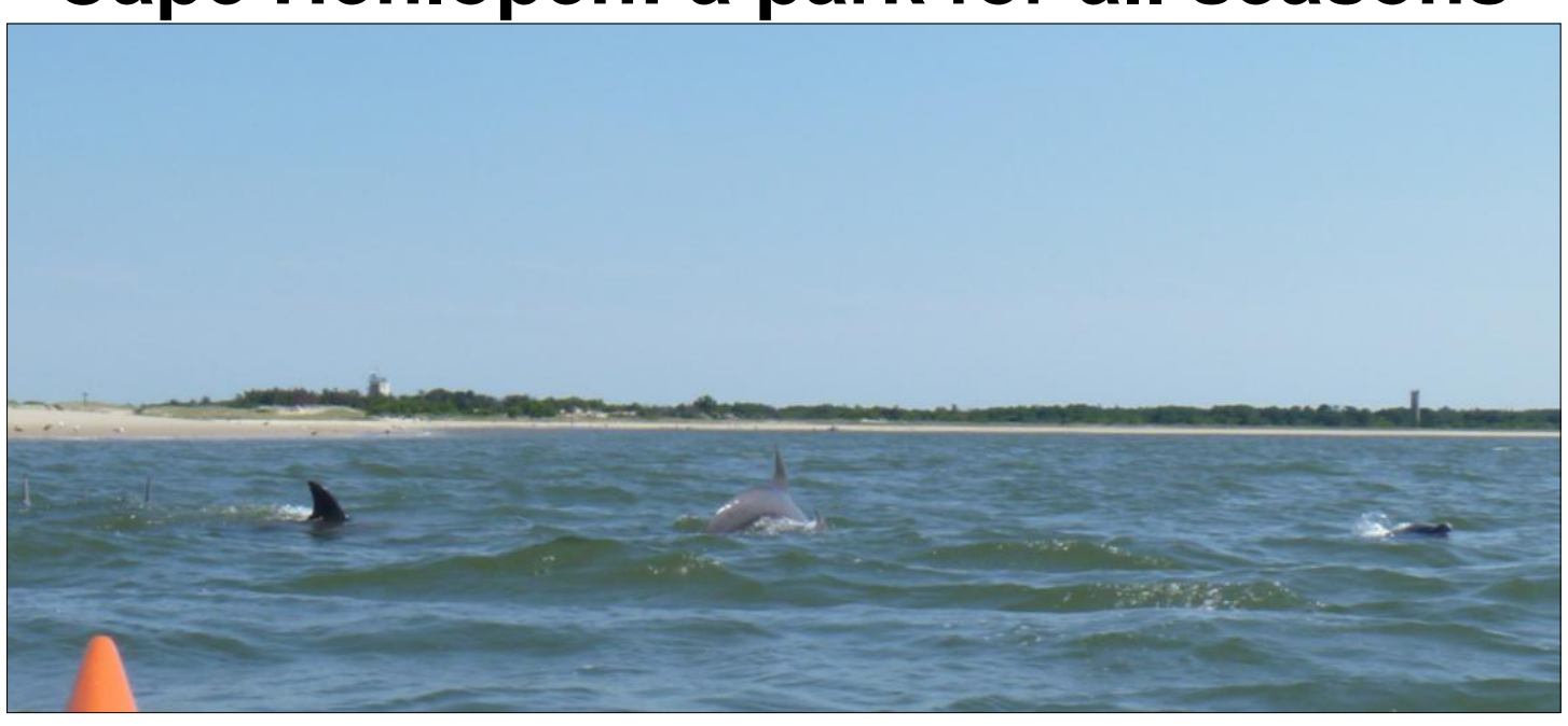
Bottlenose dolphins are a common sight when kayaking near the point at Cape Henlopen State Park. They arrive in early spring and stay until late fall.