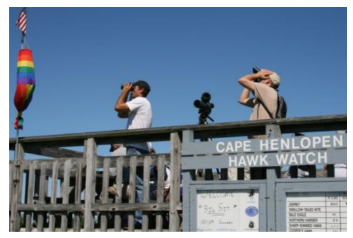
In the fall, stop by to help count migrating raptors in the morning and kayak or bike in the afternoon.

Lastly, in the fall thousands of raptors pass through the area. There's a vantage point in the park on top of one of the old gun emplacements where a naturalist and volunteers operate the Cape Henlopen Hawk Watch. They count the migrating birds from September 1 through November 30.