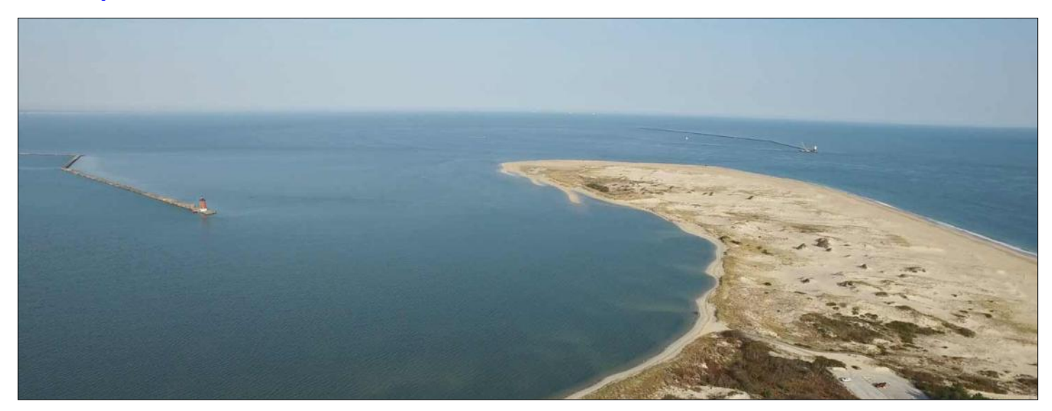
The point and lighthouses at the north end of Cape Henlopen State Park mark the mouth of the Delaware Bay, left, and

near the pier. It has been closed because of Covid restrictions, but when open it has a path straight to the beach.