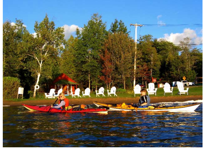
Landing at Curry's (Continued on page 10)