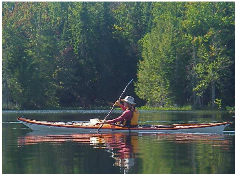
Lake Abenakee, 2007

The dates this year are 30 August to 6 September, 2008, with an option to stay an extra night. There is a great craft's fair the day we traditionally leave. How does one sign up? Simple: You email me, David Moore, dtmoore@mac.com. We do a pre-trip interview (CPA rules for trips apply here). The available number of beds (everybody gets one of their own!) and the number of leadership qualified people who sign up are what determines the maximum size of the group. Costs are based on how densely we occupy Curry's Cottages and the Inn. This depends on the group's makeup. We do get a price break, as it is the end of the season.