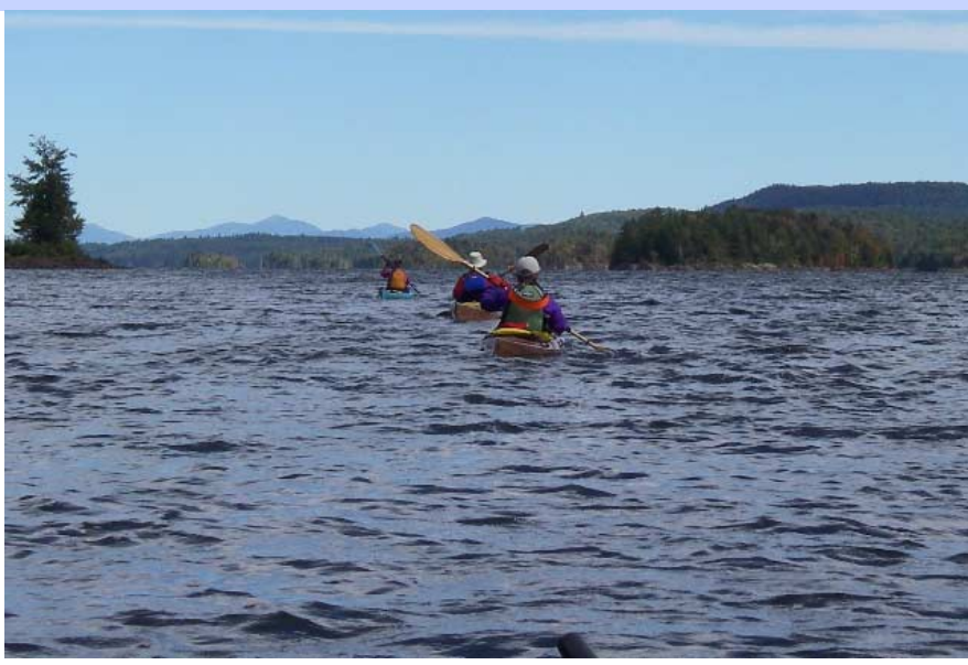
Indian Lake and the High Peaks