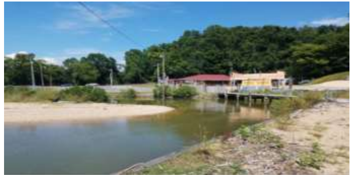
Existing Gilligan's Pier Restaurant at Pope's Creek

Pope's Creek on the Potomac is a site of some historic significance. Lincoln's assassin John Wilkes Booth attempted to flee to Virginia from here in a rowboat and got lost in the fog, landing at Nanjemoy Creek, back in Maryland before finally crossing the river. More recently, it was the site of Gilligan's Pier Bar and Restaurant, alongside the more famous Captain Billy's Crab House. Now, the 18-acre waterfront on the river and creek, and an adjacent 179-acre upland parcel are owned by the county and a waterfront park is being planned. The county needs YOUR input and reaction to their preliminary design concepts.