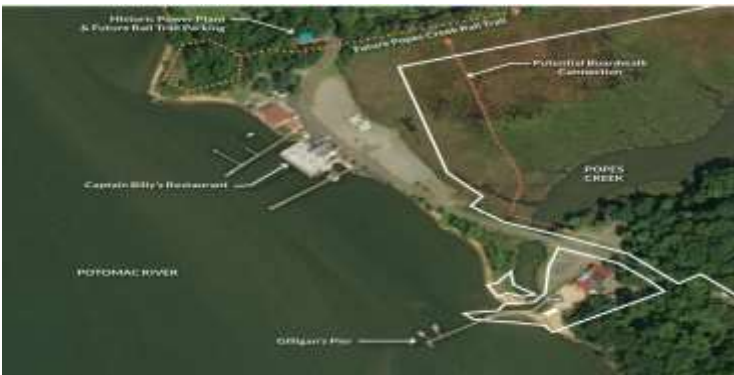
Waterfront at Pope's Creek Park

Equally exciting is the potential of the additional 179 upland acres along the creek. Concepts here include a visitor/nature center, a campground with bath house, primitive campsites, a ropes course, a solar power meadow, and an events lawn and stage area. CPA members pointed out how easy it would be to make a connection between the creek (separate from the floating kayak launch) and the primitive campsites for a paddle-in camping opportunity. We made the connection to the greater John Smith Historic Water Trail and to existing paddle-in camping at Widewater, Caledon, and Westmoreland State Parks in Virginia, and Mallows Bay, Friendship Landing on Nanjemoy Creek, Chapel Point State Park on the Port Tobacco River, and Newtown Neck State Park farther down the river.