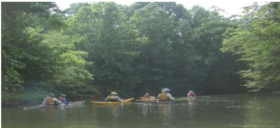
Heading down the Pax from Queen Anne Canoe Launch