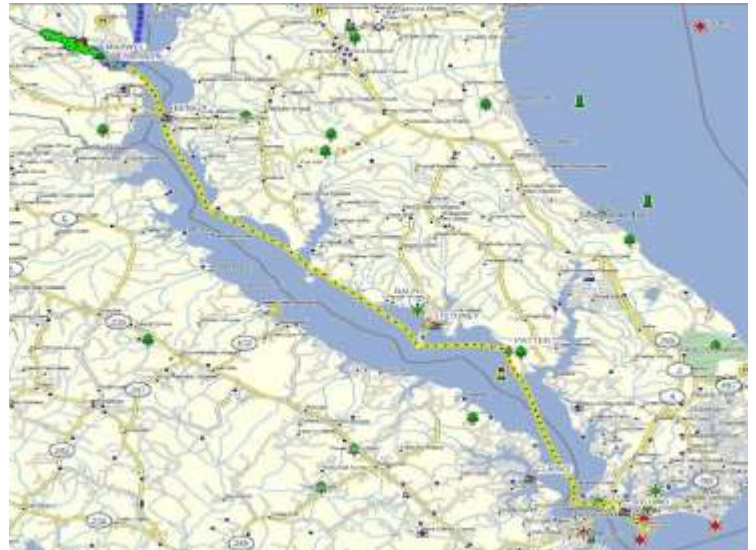
Patuxent GPS track, days 1 (green 17.9 statute miles), 2 (yellow 13.9 miles) and 3 (pale yellow 22.6 miles) GPS track by Rich Stevens