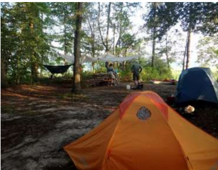
Campsite at Spice Creek