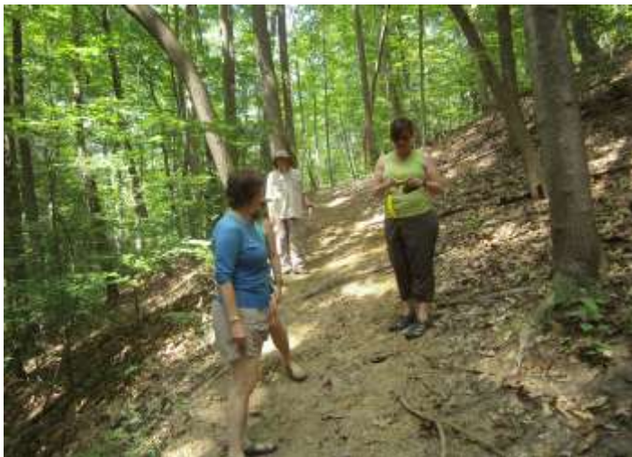
On the equestrian trail at Maxwell Hall Captain John Smith, 1612

"The fifth river is called Patuxent, of a less proportion than the rest but the channel is 16 fathoms deep in some places. Here are infinite skulls [schools] of divers kinds of fish more than elsewhere"