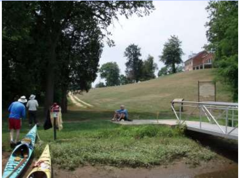
Lunch stop at Mount Calvert

CPA teaches kayak safety and rescues, and we've even had a wilderness first aid course, but little did we realize that boiling water would be the main hazard on this trip. Al Larsen suffered 2 nd degree burns in a very sensitive location as someone else's (guilty party unnamed, pursuant to the "witless" protection program) pot of boiling water slid off the stove and table and nearly landed in his lap. Some say it was justice for the quality of puns Al subjected us to, but most of us thought there must have been a Native American village torched near the site and a