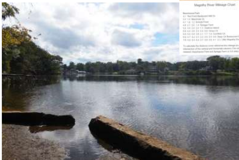
Beachwood Park Pier

Looking for a Boat or Gear? Check out the Forum want ads on our website's Gear Swap at https://www.cpakayaker.com/forum/s/forum/cpa-kayaker/gear-swap/