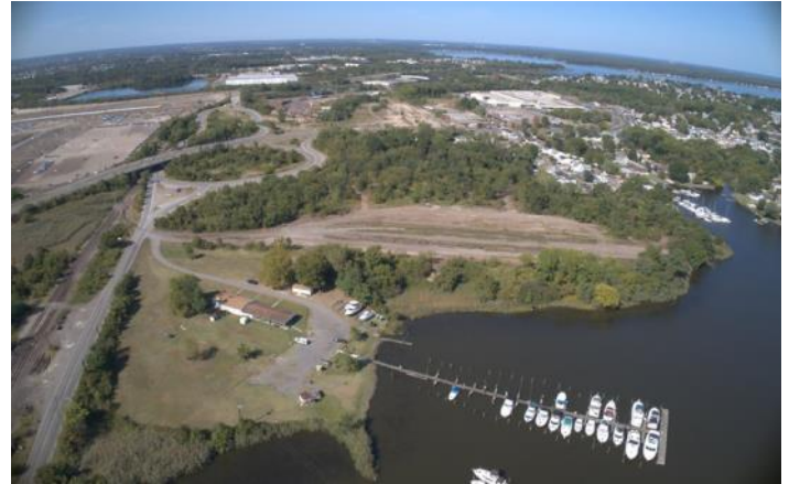
An aerial view of the Sparrows Point Park site

There's a box at the end for ideas that aren't on the checklists.