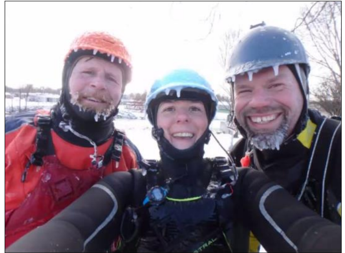
With the proper gear and education, extending your paddling season to winter can be a fun experience, like these paddlers enjoying a frosty outing.

Overall, Avery classifies paddling hazards into three main categories: cold water, adverse weather and