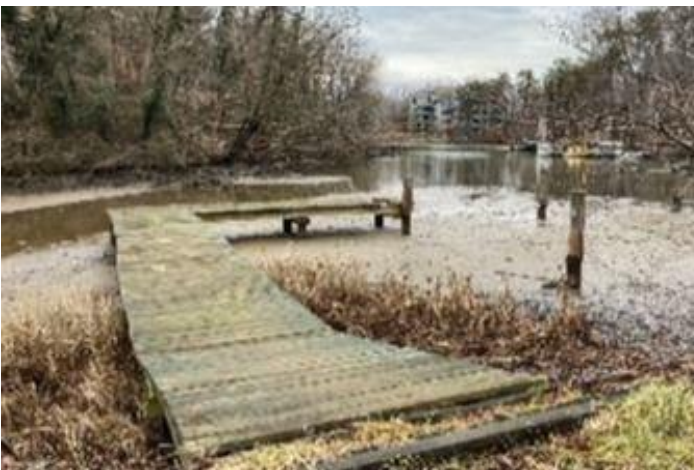
Other public park projects that deserve more funding include renovating the dock and dredging at Hawkins Cove Park.

Stormwater fee or rain tax, call it what you want, it’s the line on your property tax bill that goes to fund water clean up around the state. In Anne Arundel County the