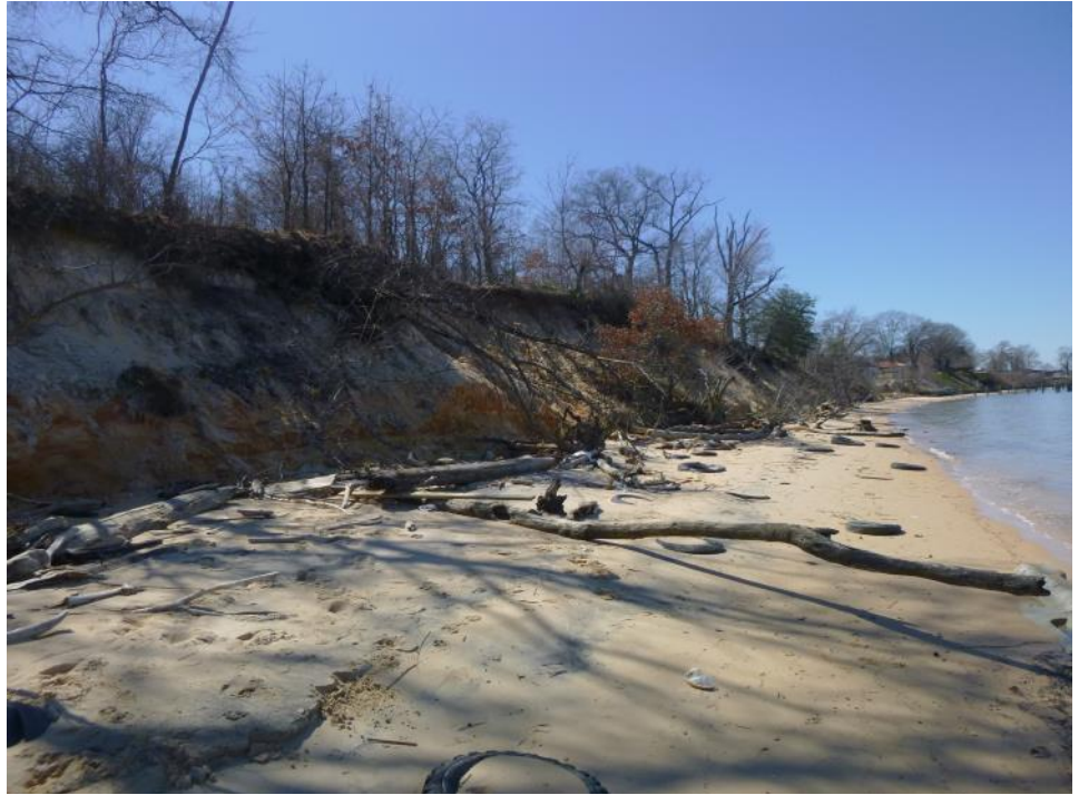
Public park projects like erosion control at Weinberg Park should be higher priorities than projects that benefit private communities.

This press release lists the 2020 WIF awards: https://news.maryland.gov/dnr/2020/07/02/maryland-waterway-improvement-fund-awards-13-5-million-2/