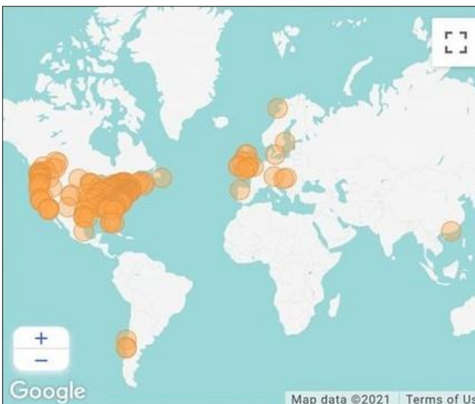
An Eventbrite data map from the Cold Water Workshop shows participants from across the globe attended via ZOOM.