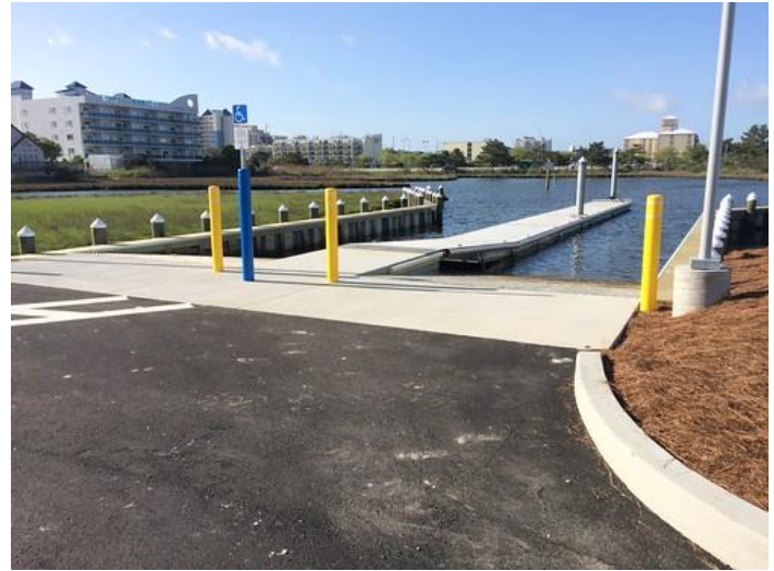
Funding for public ramps should be a big priority as it increases water access to the general public and can be used by car-top boaters.

You only have to look up your elected officials once! Email County Executive Pittman, your county councilmember, state senator and state delegate(s).