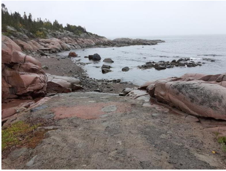
Low tide at Paradis-Marin kayak launch. At high tide, water comes up to the concrete.

Planning a kayaking trip to Saguenay poses a few challenges. Researching online is confusing at first because the area is administered by a combination of the Saguenay-St. Lawrence Marine Park (<a href="http://parcmarin.qc.ca/home/">http://parcmarin.qc.ca/home/</a>) and Quebec's Saguenay Fjord National Park (<a href="https://www.sepaq.com/pq/ssl/">https://www.sepaq.com/pq/ssl/</a>).