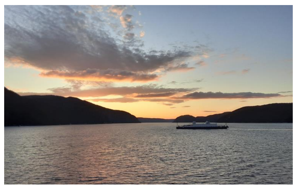
The view of Saguenay Fjord from Tadoussac ferry.

Locals also recommended what turned out to be one of the best bakeries I've ever encountered, Boulangerie Cochone. It's just a few