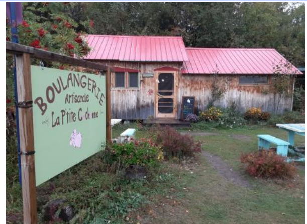
If you go, don't miss this outstanding bakery in Grande-Bergeronne village

Paradis-Marin campground no longer takes reservations, but the office is open late for check-ins. Most sites are out in the open but the ones in Loop 3 (sites in the 30's) are reasonably private. If the weather is bad, the bathhouse near the kayak launch has covered picnic tables