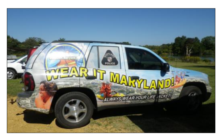
Always Wear Your Life Jacket, Newtowne Neck Open House

Happy Harbor Restaurant: <a href="http://www.happyharbordeale.com/">http://www.happyharbordeale.com/</a>