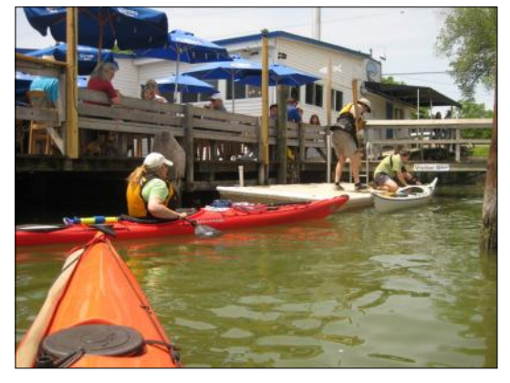
Happy Harbor in Deale, Maryland