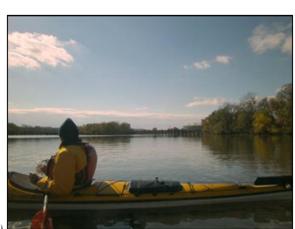
(Continued on page 11)

The Anacostia Watershed Society, a nonprofit organization dedicated to cleaning the water, recovering the shoreline, and honoring the heritage of the Anacostia River and its watershed communities just released the Anacostia Water Trail Map and Guide, now available through their website. The Trail Map and Guide, created in partnership with the National Park Service, brings together all of the resources and activities available on the Anacostia River and guides users through access points and features of the trail.