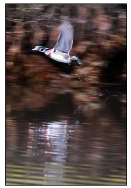
Wood Duck