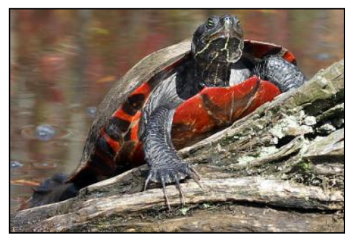
Red-Bellied Cooter Turtle

In the Pocomoke and other tidal fresh rivers around the Chesapeake, the Red-Bellied