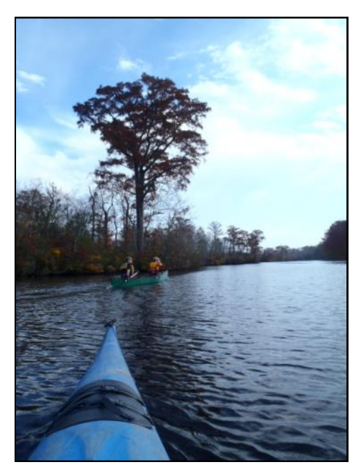
Paddling the Pocomoke in the Fall