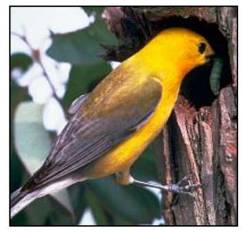
Prothonotary Warbler

This brilliant golden-yellow and olive bird draws birders to the Pocomoke in spring. The name comes from a group of Vati-