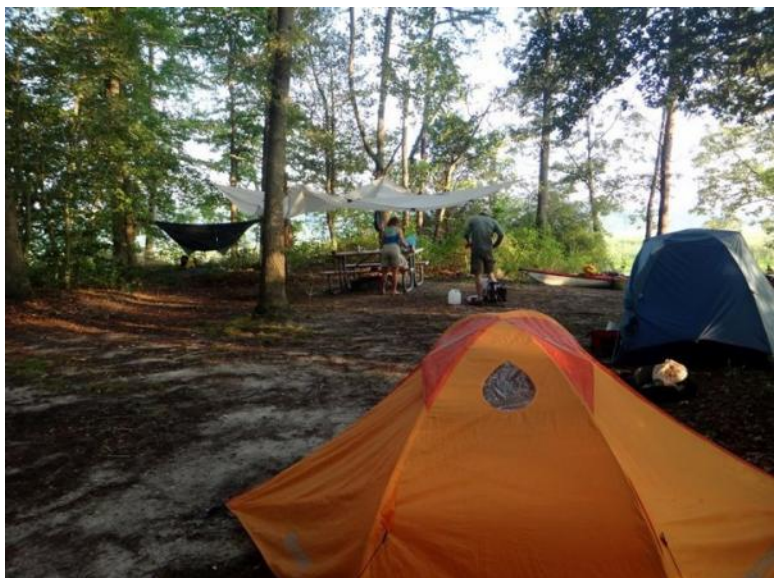
Campsite at Spice Creek

We pulled into another formidable and long-occupied site for lunch at Mount Calvert (river mile 44), just up the mouth of Western Branch (further up which is another paddle-in campsite). Mount Calvert is all that remains of another bustling colonial town established in 1684 (see <a href="http://www.pgparks.com/Things">http://www.pgparks.com/Things</a> To <a href="Do/Nature/Mount Calvert Historical and Archaeological Park.htm">Do/Nature/Mount Calvert Historical and Archaeological Park.htm</a>). The house, built originally in the 1780s and added to in the 19<sup>th</sup> century, was substantially damaged in last year's earthquake and is undergoing extensive renovations. We lunched in the shade of large old trees down at the floating dock, then packed up and headed downriver again.