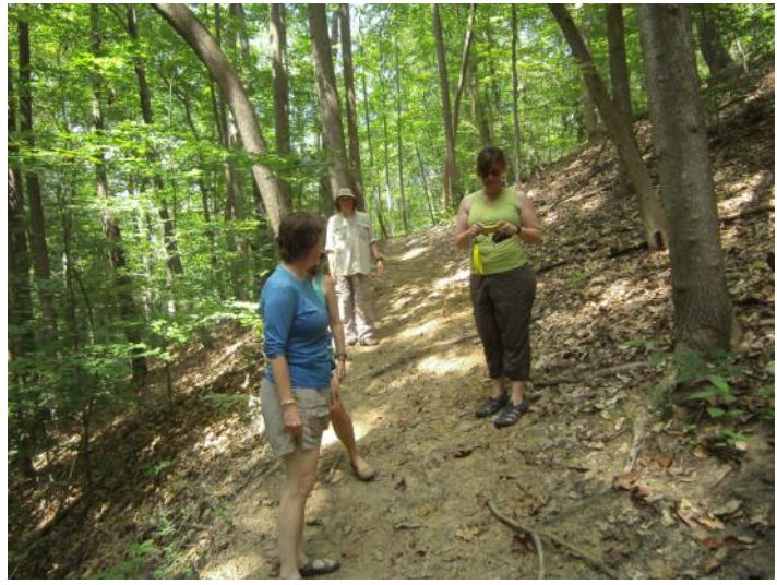
On the equestrian trail at Maxwell Hall