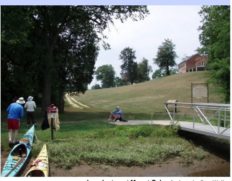
Lunch stop at Mount Calvert

We saw few boats of any kind until we reached the Route 4 (Hills) bridge. The Friday commuters were gone by now, and nobody was fishing off the platform beneath the bridge except the occasional Great Blue Heron. We passed Pig