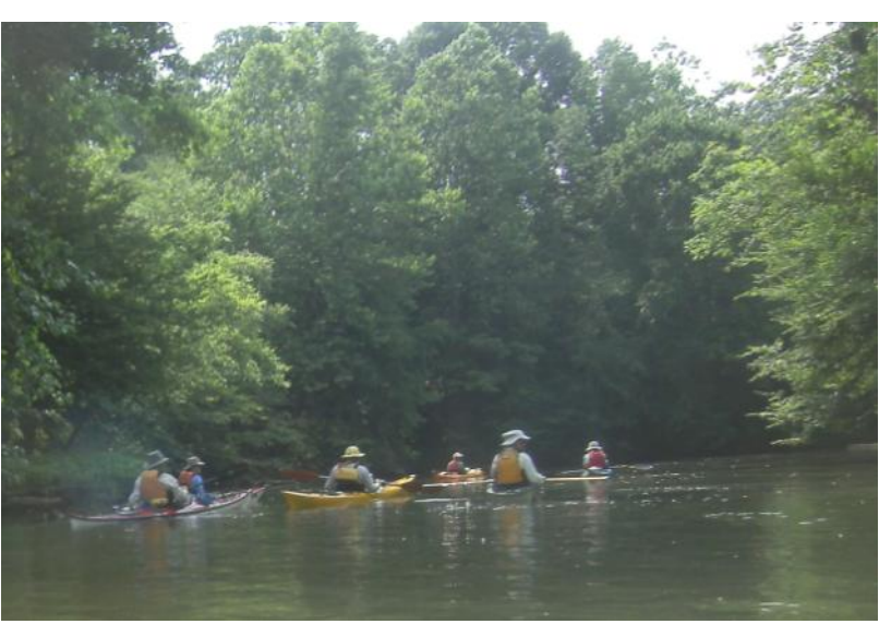
Heading down the Pax from Queen Anne Canoe Launch

The Patuxent is narrow and the current can be swift at the launch. It is very difficult to believe that Queen Anne was the official port of embarkation for the Pax in 1706, with ocean going ships making their way this far up the river. As the interior was settled and forests were cut for farm fields, silt clogged the once clear waters of the Patuxent and Queen Anne was gradually abandoned as a port. The last ocean-going ship left Queen Anne in 1790.