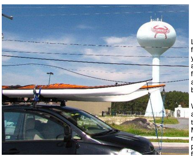
Silly Rabbit—Crisfield is for Crabs!

We rented the Daugherty Creek Conference Center in the park. It sleeps 16 people in 4 rooms, each containing 2 bunk beds. The house was large and comfortable. Upstairs, there was a wide-open area that was set up for presentations (more on that later). It had a screened porch out back that contained picnic tables, as well as a large grill and a fire ring. The kitchen was spacious and contained a commercial refrigerator, a commercial freezer, and a sink big enough to wash a large dog or a mid-sized child. But enough about the accommodations.