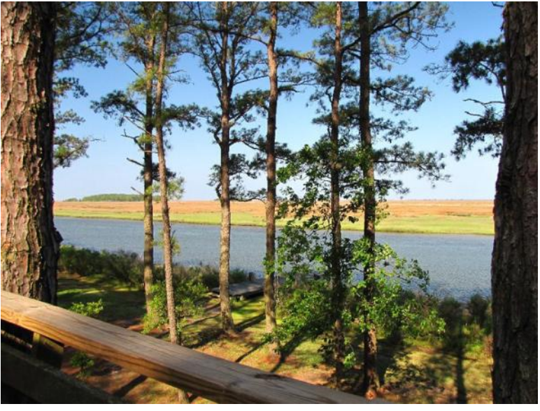
Janes Island from the State Park area

We invited a lot of people we know from the Greenland paddling community and a few members of our local paddling crowd. We were fourteen people total, including people from New York, New Jersey, Pennsylvania, and Maryland. Most of us paddle mainly Greenland style and are interested in rolling skills. We liked the idea of having some clean flat water for rolling practice, and we also hoped to find some variety on the outside of the island for those who wanted something rougher.