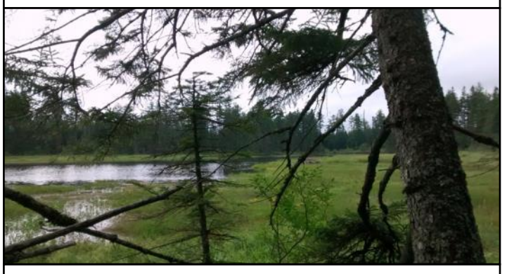
Fourth Connecticut Lake looking south toward U.S.

Next day, we loaded up the boats and drove up to Second Connecticut Lake, a reservoir of some 1,102 acres (458 ha) with a nice public launch just off NH 3. We paddled up the lake against the western shore to shelter from a 5-10 kt wind, intending to follow the interconnecting river up toward Third Lake. Families of loons fished the lake, and we rousted a flock of Goose (not Moose) as we turned up the river. Merganser and Teal winged off as we paddled up the narrowing river. We got as far as the bridge carrying the East Inlet Road, then turned around as the cobbled bottom came too close for comfort in our composite boats. The wind had picked up as we returned, making a bit of heavy going for the canoes. We went back to the launch, and then paddled on down to the dam.