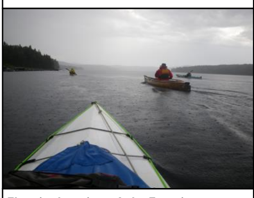
Fleet in the rain on Lake Francis

Pool area has some of the region's only virgin boreal forest remnants, and gas motors are prohibited. Although this is another prime piece of Moose habitat, the largest mammal we encountered was a "Bull" chipmunk bound and determined to cross the brook despite our presence.