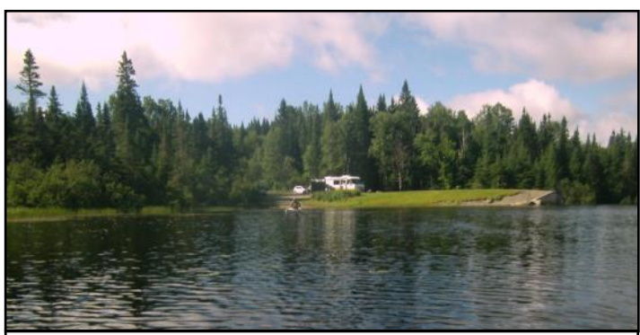
Launch at East Inlet

Pool area has some of the region's only virgin boreal forest remnants, and gas motors are prohibited. Although this is another prime piece of Moose habitat, the largest mammal we encountered was a "Bull" chipmunk bound and determined to cross the brook despite our presence.