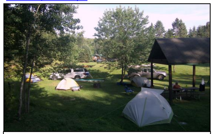
Camp at Lake Francis State Park, NH

Naw, just Canadians!). Once so remote that settlers seceded from BOTH the U.S. and Canada, establishing their own Indian Stream Republic, this area is still little visited. The view from the heights around Fourth Lake back into Maine and New Hampshire was inspiring, and we scoped out the other Connecticut Lakes, our paddling venue for the next few days. On the way back to camp, we scouted each of the lakes in turn. Third Connecticut Lake is a small (231 acre; 93 ha) but deep (up to 100 feet) natural lake that we surveyed from the parking lot, but decided against paddling.