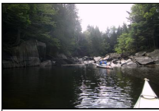
Paddling up to the rapids on Connecticut River inlet to Lake Francis

We ducked into Dead Water Brook and landed on a muddy island for lunch, as rain clouds threatened. Shortly after re -embarking, the deluge began and we paddled to the main lake before thunder started to boom and we