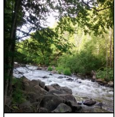
Connecticut River above Lake Francis

Back at camp, we took the portage trail alongside the Connecticut River running between First Lake and Lake Francis. The river here is a rushing, gushing whitewater torrent dropping 259 feet in two miles. With a spring run, it may be navigable by whitewater boaters, but it looked pretty impassable to us. The sound of rushing water over the shadedappled rocks was a cool refuge, and great habitat for brookies (restricted to fly fishing only).