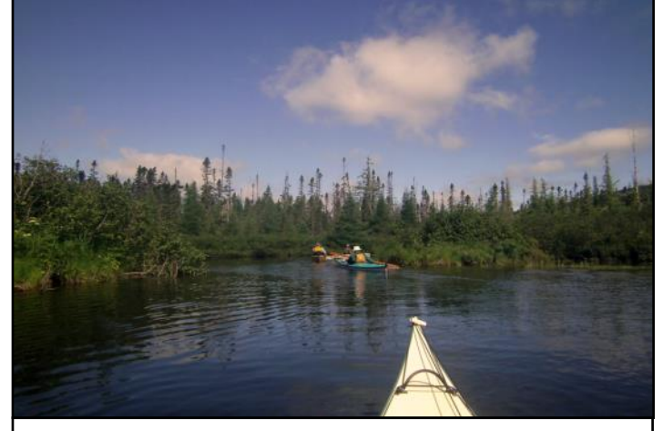
Into the Alder/Black Spruce Swamp

the more Spartan gear we would take kayak camping on the river for the next 5 days. Next morning, we packed up our dew-soaked tents early for the drive down to the Pastures campground in Orford, NH. There, we parked our trucks and met up with Scott Edwards, who runs Hemlock Pete's Canoes in Orange, VT, our shuttle for boats, gear and ourselves up to Lancaster, NH, for the 75-mile downriver run.