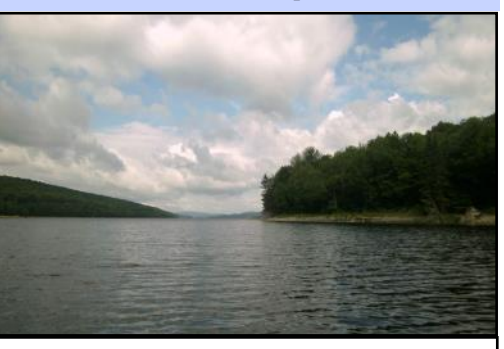
"Six Mile View" to Murphy Dam

Connecticut Lake. We chose the road to the East Inlet launch, another small dam creating a narrow lake with a long, meandering tail through dense alder swamps. Compared to other launches, this little beach was positively crowded with paddlers (there were 3), both coming back and heading out. But East Inlet is a little (60 acre), shallow jewel of an Adirondack-like pond, with red spruce, fir and white pine on the drier hillsides and alder, tamarack and black spruce cloak the wetter areas. The Norton