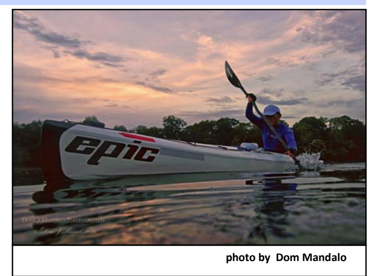
she fully recupes from minor surgery. (Psst Rita, I may have found a new kayaker model!!) ;)

Fortunately, the clear waters and our attitude offered welcome respite to the heat, as we paddled up to the second island, Tenfoot Island, where we enjoyed refining various technical skills, such as bow and stern rudder, sculling and balancing. I even got to practice using my new short tow by paddling an 'injured paddler'!:)