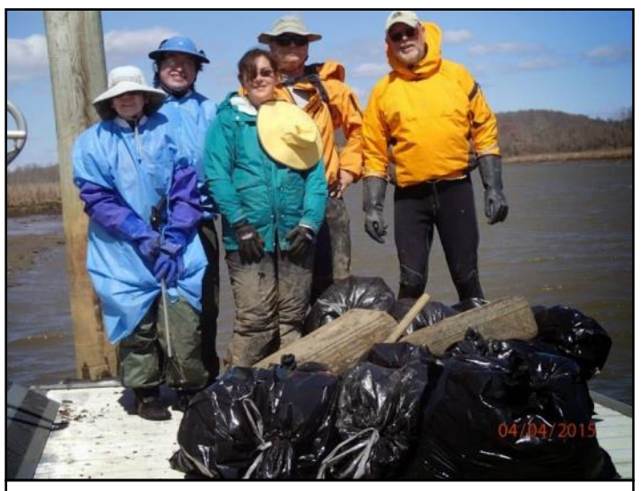
PAX River Clean-up

Finally, the paddle season goes into full swing in May when many of the week-day <u>Piracies</u> start up again and there a number of trips, activities and events on the <u>CPA Calendar</u>. While there are many things scheduled this season, it is never too late to add another trip or event. With more than 650 members, there are enough to come to several activities on each weekend in different parts of our wide Bay area—the only limit is those volunteers willing to step forward and lead.