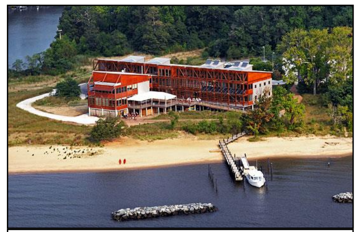
Aerial view of the Philip Merrill Environmental Center.

The Secretary shall perform all duties generally incident to the office of Secretary, subject to the control of the Steering Committee and the oversight of the Coordinator. S/he has primary responsibility for maintaining club membership records, but may delegate day-to-day administration of that task to another club member. S/he shall give notice of all meetings of the general membership or the Steering Committee and all other notices required by these bylaws. The Secretary shall record the proceedings of all meetings of the general membership and of the Steering Committee. All records of the Secretary shall be the property of the club.