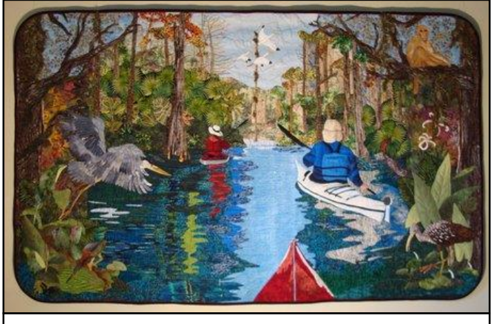
Silver River Serenity