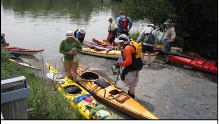
Miles River Trip

So, get out and enjoy the best the Chesapeake has to offer in the hot, humid, hazy summer months, but BE COOL, and KEEP A WEATHER EYE OUT!!!