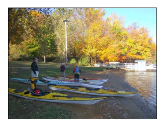
2013 CPA Annual Meeting Paddle, Truxtun Park, Annapolis, Maryland

Public service announcement and personal ads to sell kayaks/ accessories are printed at no charge; non-members pay $10 for 3 months.