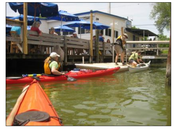
Happy Harbor in Deale, Maryland