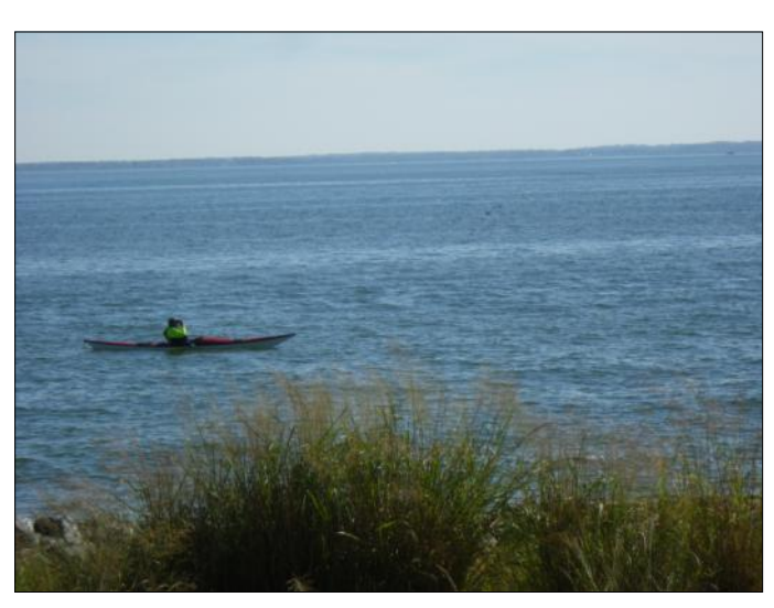
CPA Trip at the Newtowne Neck State Park Open House