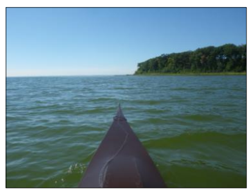
Newtowne Neck State Park Open House