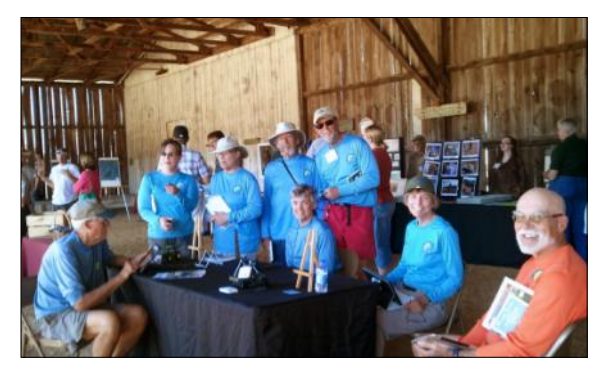
CPA members at the Newtowne Neck State Park Open House