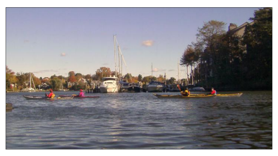
2013 Annual Meeting Paddle Annapolis, Maryland

Check the CPA website, the Pirates of Arundell's forum discussion for the location schedule for the remainder of the 2014 season: http://www.cpakayaker.com/forums/viewforum.php?f=10.