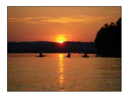
Pirates of the North

<u>Pirates of the Occoquan</u>–A group of dedicated paddlers from Northern Virginia who meet weekly to paddle various Northern Virginia Regional Parks during the evenings. The Pirates will