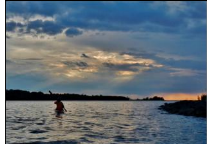
Pirates of the Eastern Shore at sunset

Pirates of the Eastern Shore–Pirates of the Eastern Shore paddle from various locations in Kent County Thursday evenings. Paddling out of Turner Creek, we can explore the heron rookery in the spring and the lotus blossoms in the summer. Sea Nettles don't make it into the Sassafras River so it's an ideal location for rescue and roll practice mid-summer. Some evenings we paddle into Chestertown or Rock Hall for dinner at a local restaurant. Every week can be different. Because we are a small local group, meeting places and even evenings may vary. Last year when the weather declined to cooperate, we were faced with a formidable forecast, so we simply paddled on another evening. Contact Pirate Queen Paula (paula@md-kayaker.com) if you are interested in joining our group. Visitors are welcome. Also, since we are a very small group, it's a good idea to email me to confirm if and where we are meeting. My work schedule is very tight this year so I may not always be available to lead, but if I know we have visitors, I may be able to adjust the schedule. Paula Hubbard