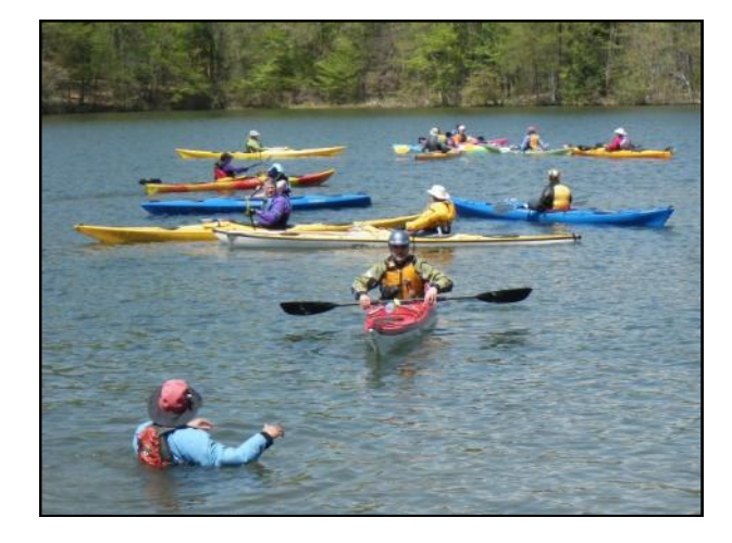
SK 102 Classes at Lake Anna, April, 2014