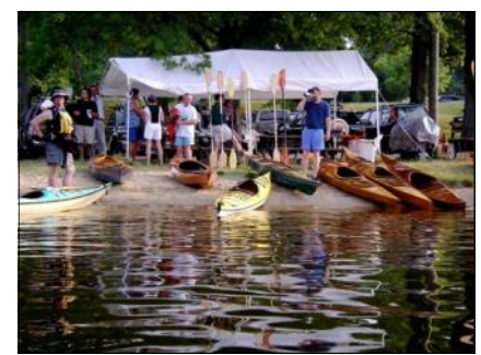
Pier 7 Pirates on the South River

Pirates of Pier 7 —The Pirates of Pier 7 meet at the Pier 7 Marina, located on the South River just outside Annapolis. We paddle Wednesdays 4 p.m. until dusk. We will paddle every Wednesday after work until Halloween time. The Pier 7 Pirates group is the oldest and largest running piracy in our club. We are so fortunate to have many places to explore each week. We usually run out of daylight even during the long hot summer evenings while out exploring the coves and creeks on the South River. Paddlers can float with the high tide into the quiet marshes and hidden woodsy creeks to discover another new beaver dam, or paddle down river into wide open Chesapeake Bay water at the mouth of the river, or do a 12+ mile circumnavigation of Turkey Point Island past lots of errant sailing classes. Hidden natural tidal ponds are ours to explore, nesting osprey, bird watching while bobbing, sailboat spotting, playing with the waves from passing boat traffic, quiet beaches, and many expansive waterfront homes – all are only accessible with our