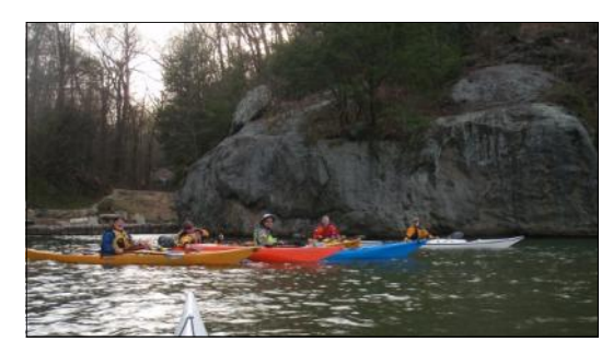
Pirates of the Lakes

Pirates of the James–Come join the Pirates of the James. We kayak on Wednesday evenings. Launch time is 6 p.m. We launch from Lawrence Lewis Park at 12400 Wilcox Wharf Road, Charles City, Virginia. Lawrence Lewis Park is conveniently located between Richmond and Williamsburg. For those who are unfamiliar, directions and additional information about the park are available on line <a href="http://www.dgif.virginia.gov/vbwt/site.asp?trail=1&loop=CPL&site=CPL06">http://www.dgif.virginia.gov/vbwt/site.asp?trail=1&loop=CPL&site=CPL06</a>. We typically end our evening with a visit to Cul's Courthouse Grille in Charles City, for those who are interested in joining us. If ye decide to venture down this southerly direction, a good Pirate can look forward to an informal group of paddlers monthly safety and rescue practices, kayak and car camping, social events in the off season, and, of course, eating...lots of eating! In fact, aside from paddling, eating is what we do best! We hope that you can join us!