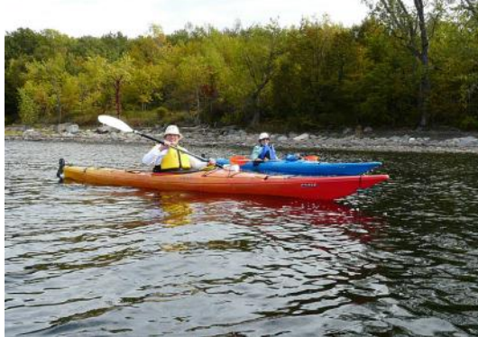
Lake Champlain

We kayaked in five different bodies of water. We all arrived on Sunday and on Monday AM it was raining, so we traveled to the Abbaye Saint-Benoit where we heard the monks singing Gregorian chants (also purchasing some excellent blue cheese) and then on to Lake Memphremagog in Quebec for a late morning and afternoon paddle on quite calm water. It was still raining lightly but that was fine. Lots of lily pads and birds. Tuesday we traveled to Lake Brome, Quebec, and experienced a little wave action (the only agitated water we experienced). We kayaked about half a mile in the open lake and entered the Brome Marsh, which was mostly winding channels.