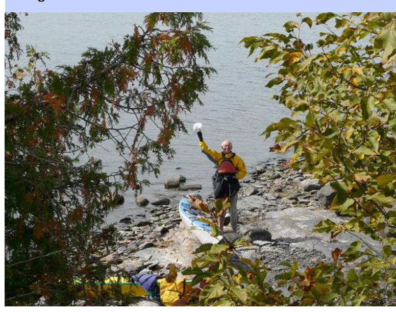
Lake Champlain