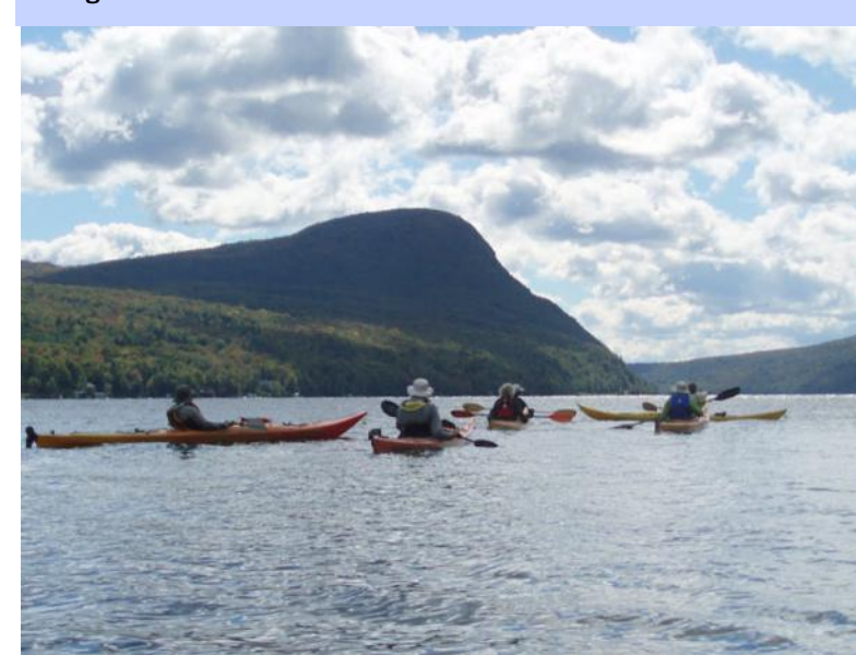
Lake Willoughby, Canada

We kayaked in five different bodies of water. We all arrived on Sunday and on Monday AM it was raining, so we traveled to the Abbaye Saint-Benoit where we heard the monks singing Gregorian chants (also purchasing some excellent blue cheese) and then on to Lake Memphremagog in Quebec for a late morning and afternoon paddle on quite calm water. It was still raining lightly but that was fine. Lots of lily pads and birds. Tuesday we traveled to Lake Brome, Quebec, and experienced a little wave action (the only agitated water we experienced). We kayaked about half a mile in the open lake and entered the Brome Marsh, which was mostly winding channels.