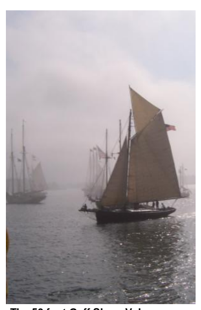
The 50 foot Gaff Sloop Vela comes to anchor as the fog lifts Brooklin, Me

A 5% discount will be given for ads supplied as electronic files in acceptable formats (i.e. .tif, .gif, .jpeg, bit-map). Email or call for more information and for 10-month discount. See advertising contact in masthead.