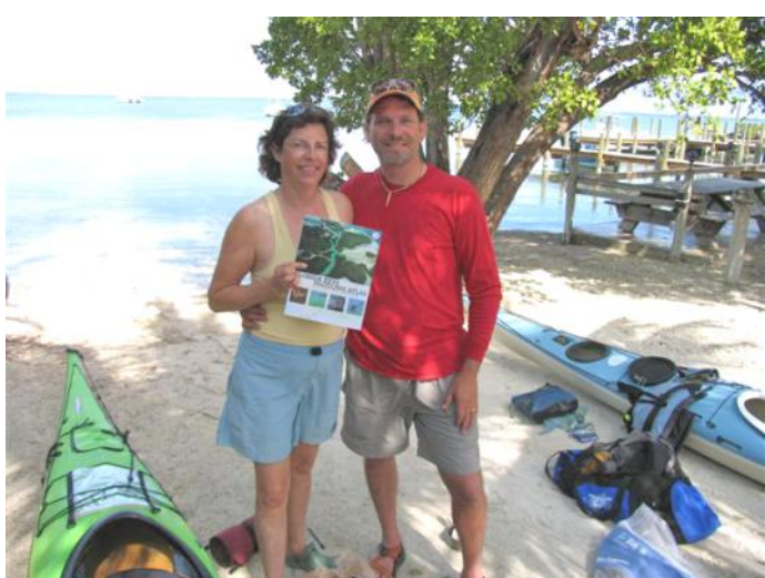
Burnhams preparing for 100-mile trip