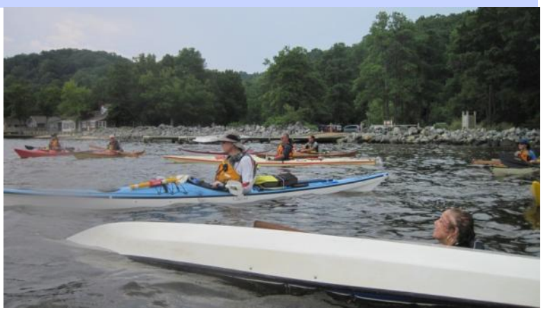
Trip Leader Training