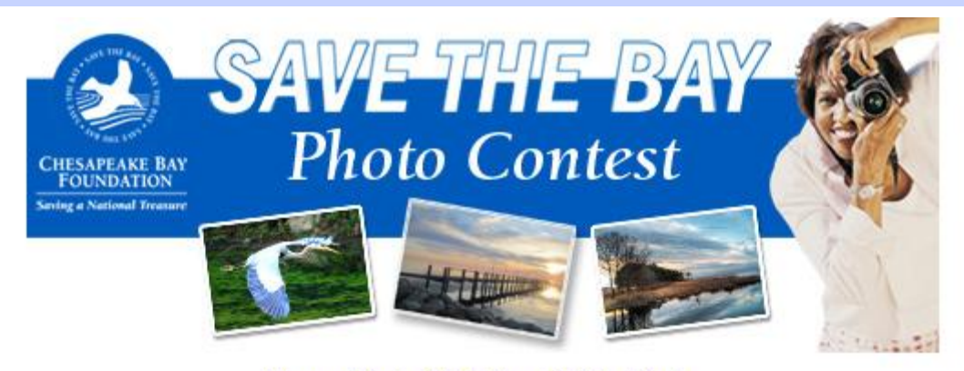
Home | Photo Guidelines | Official Rules