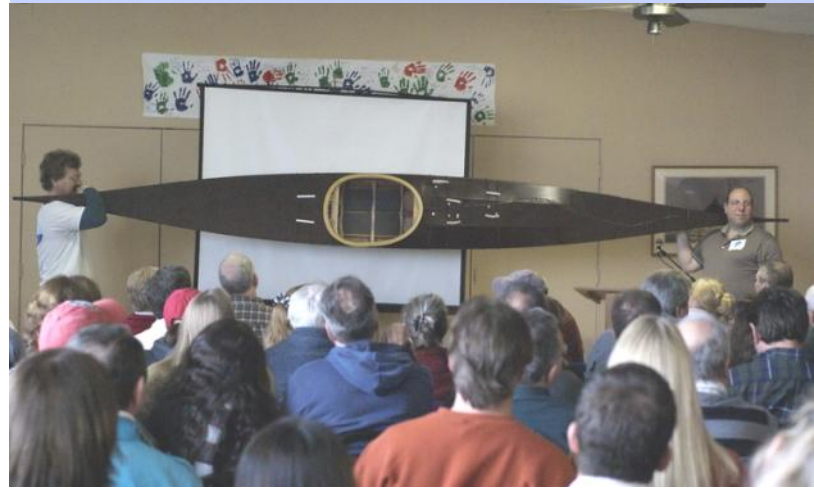
Boats and more at SK101