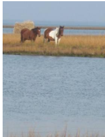
What ARE those folks doing?

Assateague Kayak Camper (Continued from page 1)