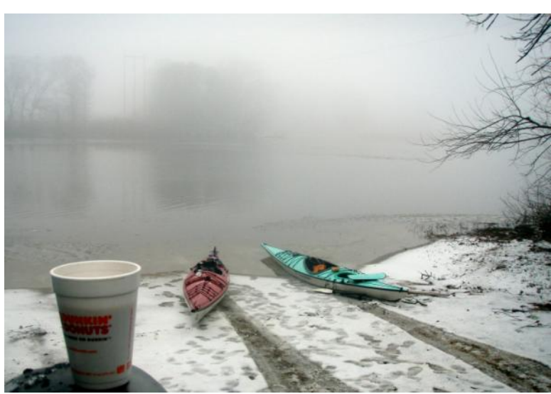
Dunkin' + Kayak = Perfection (an entry in the calendar contest)

Page 10 Chesapeake Paddler February 2011