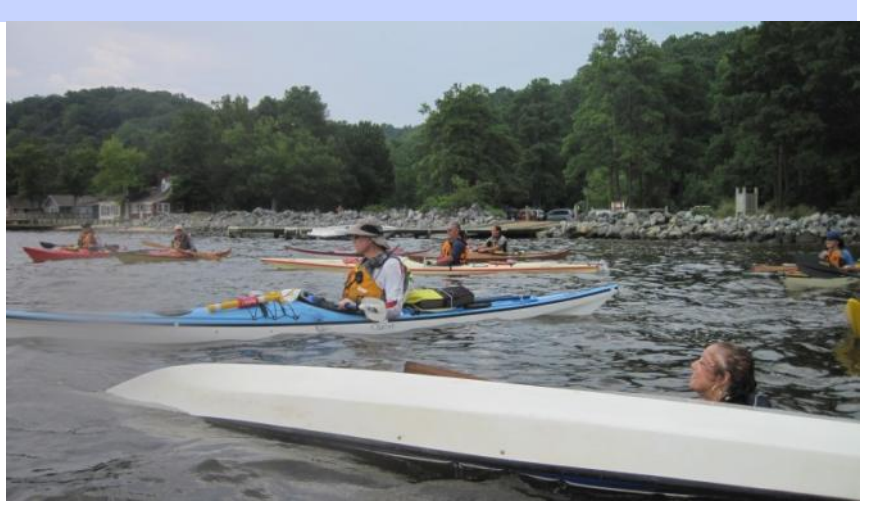
Trip Leader Training

Trip Leader Training will take place on May 14-15, 2011, most likely in the Annapolis Area. Attendance both days will be required for successful completion of the training. We are not prepared to take registrations as this point. We will post something on the forums when we are ready.