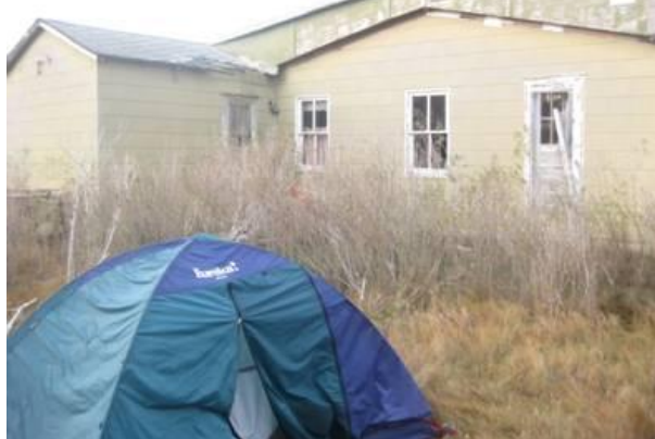
ground that we could find. The night was cold, and the ground was damp, and we huddled deep in our sleeping bags, and wore all our warm clothes at breakfast. Our campsite looks messy, because we were hanging our damp clothes, but we packed everything before we left.

Our commando campsite