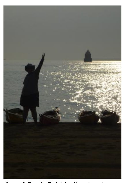
from A Sandy Point Invite (an entry in the calendar contest)

A 5% discount will be given for ads supplied as electronic files in acceptable formats (i.e. .tif, .gif, .jpeg, bit-map). Email or call for more information and for 10-month discount. See advertising contact in masthead.