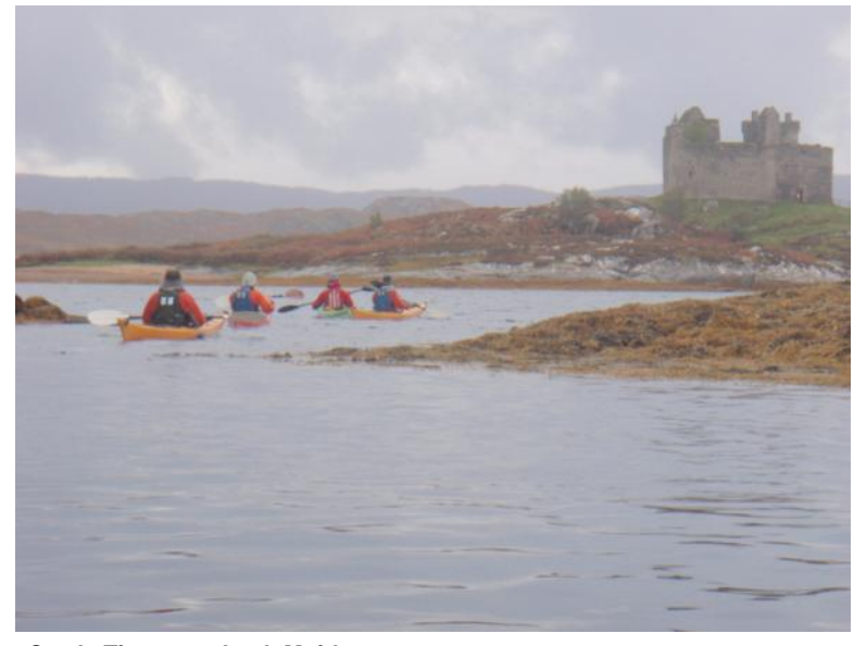
Castle Tioram on Loch Moidart

The next day was cold, raining, with wind gusts to 27 mph: Typical Scottish weather. We headed to Loch Moidart. My kayak was again weighed down. Because of the adverse conditions, the guides taught us low braces. We practiced as we were buffeted around the cove. The rain was heavy enough to make seeing beyond our kayaks difficult. We stopped for lunch at a former heron colony on an island just as the sun broke through the clouds. We were cold and wet. Carol and Dave quickly built a fire for hot drinks. After lunch, we practiced side strokes and sweeps and searched unsuccessfully for otters. As we headed back, we paddled around the ruins of the Jacobite castle Tioram. The castle's claim to fame? It was featured in a Superman movie! Thanks to the retreating tide, we were faced with a portage of nearly 100 feet! Between fighting winds and dragging our kayaks so far, we were looking forward to a hearty meal. Our bunkhouse had a wonderful menu: Local seafood and North African food. As expected in Scotland, it also had a full array of whiskeys.