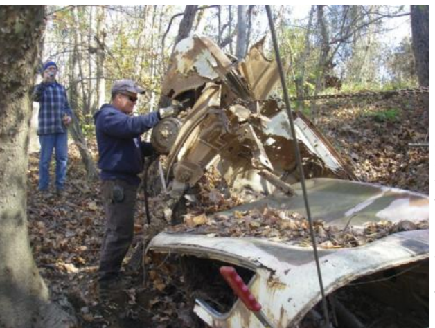
Chip Walsh gloating over dead car