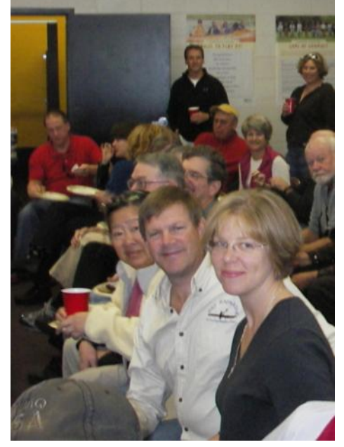
CPA Annual Meeting, 2010

A 5% discount will be given for ads supplied as electronic files in acceptable formats (i.e. .tif, .gif, .jpeg, bit-map). Email or call for more information and for 10-month discount. See advertising contact in masthead.