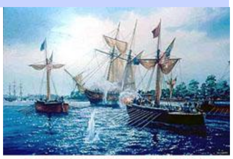
Barney's Barges in Action at St. Leonard's Creek, 10 June 1814