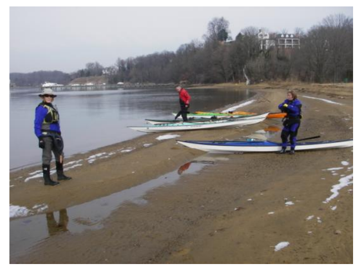
You can still paddle, even through the snow is on the ground (launching at Jonas Green State Park on the Severn in January)

If you have any ideas for ways to make the club even better than it already is, please share them, either via email or just post on the message board to start a club-wide discussion. I hope to see a lot of you at the pools this winter and at events this the summer, and hopefully you'll be dripping wet and smiling.