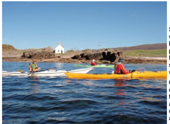
Sheep may safely graze where an accordion plays