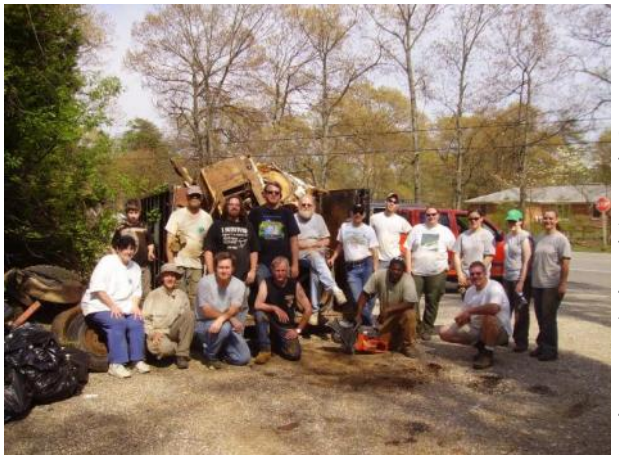
Pax River trash and trashers in 2009