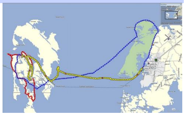
Yellow track: Friday 17.6 Mi. Red Track: Saturday 11.8 Mi. Blue Track: Sunday 21.4 Mi GPS track by Rich Stevens

We decided to break into two groups, one going on to cross over to Tangier Island, and the other group completing the clockwise circumnavigation around Smith Island. Ralph, Gina, Laurie, and I headed up the west coast to Rhodes Point, admiring the many birds along the way. We noticed a long line of power lines over the water that ended where Shanks Island used to be. Paddling on to Rhodes Point, we took the Doctor's Gut through the marsh to Ewell. We stopped at Ruke's and