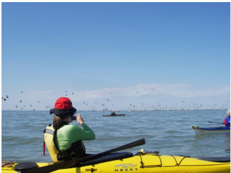
Pelican swarm at Smith Island's South Point Marsh