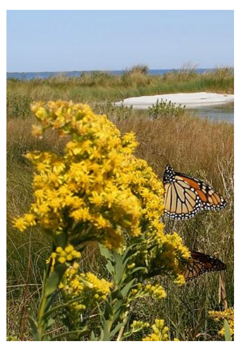
Monarch on Goldenrod, Smith Island

A 5% discount will be given for ads supplied as electronic files in acceptable formats (i.e. .tif, .gif, .jpeg, bit-map). Email or call for more information and for 10-month discount. See advertising contact in masthead.