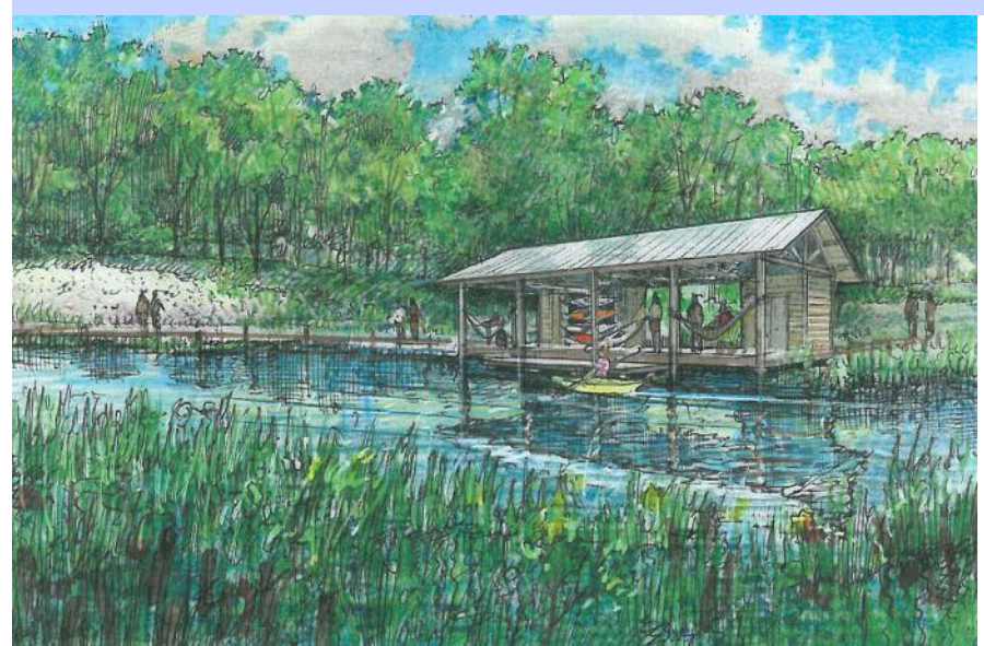
Artistic view of kayak/canoe platform and hammockry on Catfish Hole, Battle Creek from Biscoe Gray Heritage Farm Draft Plan