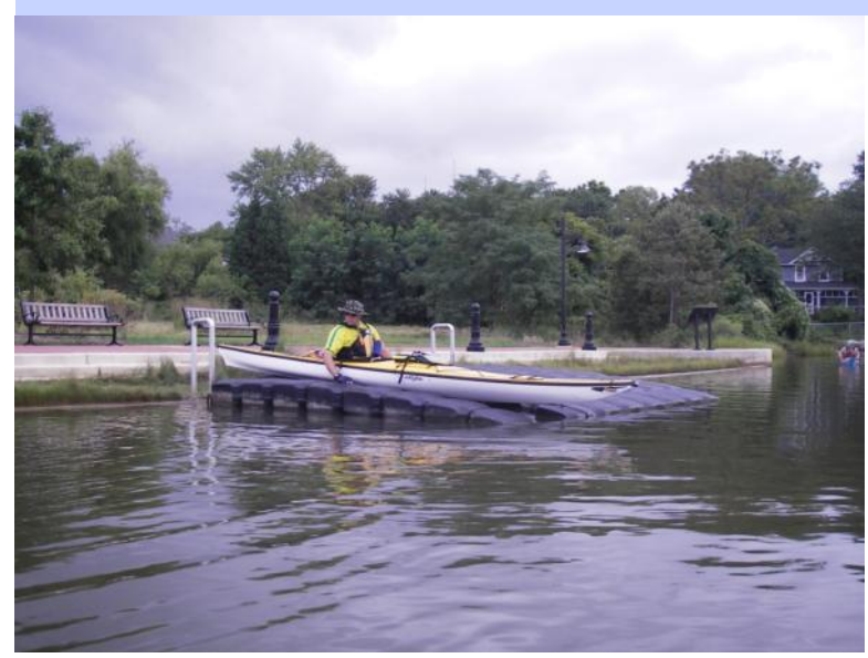
New Kayak Launch at Leonardtown Wharf