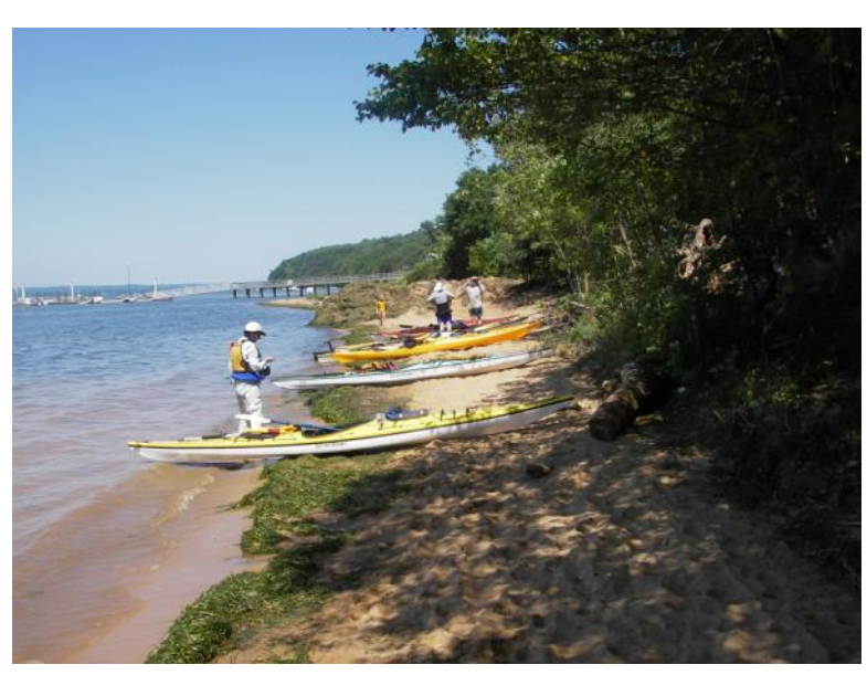
New canoe and kayak launching beach at Elk Neck's Northeast Beach

Page 10 Chesapeake Paddler September 2010