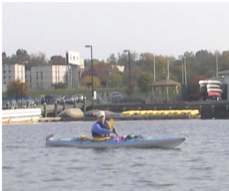
Annual Meeting Morning Paddle, 2008

Yes. It is time for the 2009 CPA Annual Meeting. This is the time that we review the events of the past year, and look forward to what the club plans for the year to come. At this meeting we will visit topics of concern for the direction of the club, but most importantly we will elect the CPA Officers and Steering Committee for 2010.