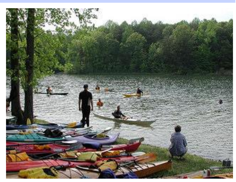
SK102 participants benefit from learning in the clear, warm waters of Lake Anna, located near Mineral, VA.

Looking for a weekend filled with purpose and fun? Look no further than SK102 for great instruction and a whole weekend of fun with like-minded folks. Basic strokes and wet exits, intermediate strokes and bracing, self rescues, group rescues, advanced rescues, and much more. All this at the bargain price of $60! Whether you are new to kayaking or interested in techniques to raise your paddling and safety skills to the next level, SK102 is an opportunity you do not want to miss. Registration is open until March 20. For details and to register, visit the <u>SK102 Eventbrite page</u>.