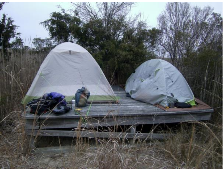
{\it Back country\ campsites\ offer\ little\ beyond\ wooden\ tent\ platforms-and\ solitude.\ Protip:\ go\ early\ in\ the\ paddling\ season\ to\ avoid\ the\ bugs.\ Photo/Ralph\ Heimlich

Joining me were Sue Sierke, Greg Welker and Dave Isbell. We were all paddling larger touring kayaks, were well equipped with dry suits and insulation to deal with 47-degree water temperatures, and were blessed with a benign weather forecast (partly sunny, air temps ranging from mid-40's to mid-60's, very little rain, and winds at 10-15 kts from the SW). We arrived at the Janes Island boat ramp about 10