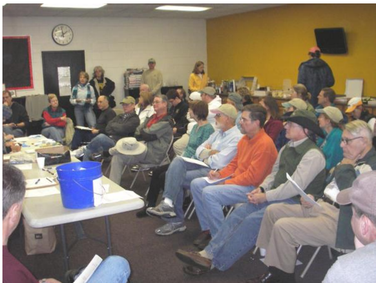
The CPA Annual Meeting is all about—YOU!