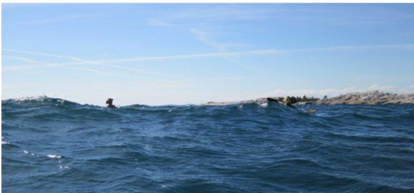
Where's Waldo I? Find the two kayaks in this picture

R called over the radio that he'd found a nearby island with nice campsites and sand beaches. We paddled over and Jim decided he was going to have a nice campsite on the sand. I tried to help R set up a camp on the rocks in a 20 knot wind. After much fighting, we decided that maybe our tent would do better if we moved it into a little pocket in nearby trees. While doing that, I heard Jim shouting about having mice down on the beach. As we were cooking dinner, mice would run straight up to our cooking pots.