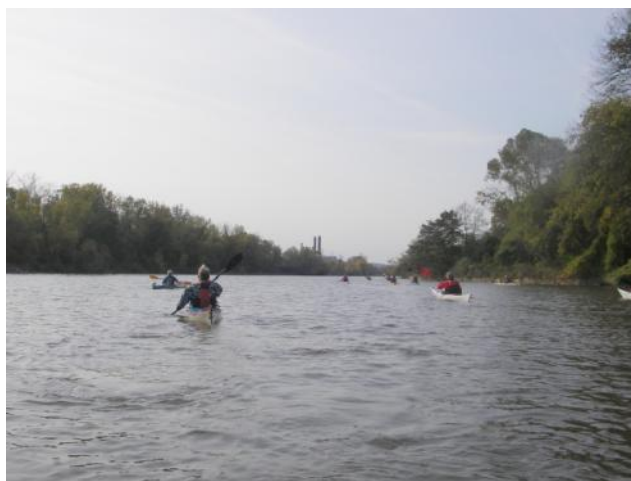
Fall Paddling on the Anacostia