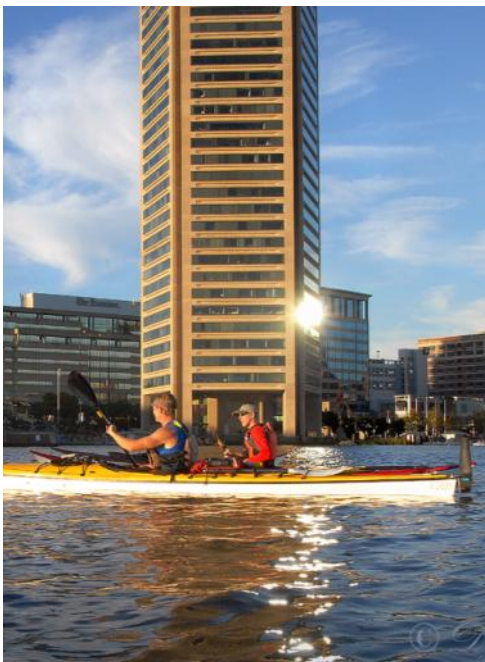
Fearless Pirate Rob zips into Baltimore's Inner Harbor

A 5% discount will be given for ads supplied as electronic files in acceptable formats (i.e. .tif, .gif, .jpeg, bit-map). Email or call for more information and for 10-month discount. See advertising contact in masthead.