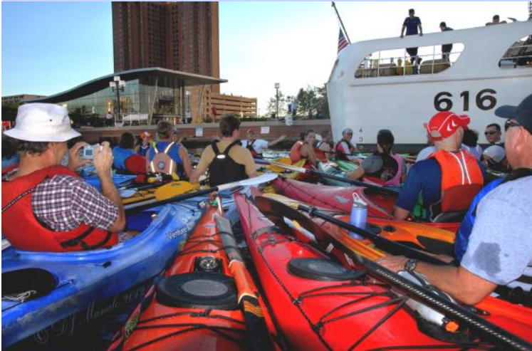
Team River Runners-Canton Kayak Club-Chesapeake Paddlers Association 9/11 Paddle, Baltimore