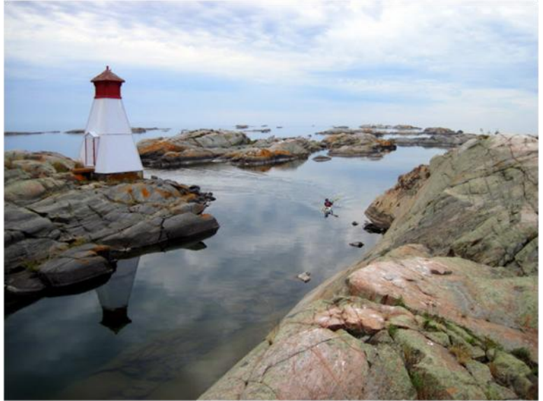
Bustard Rock Lighthouse

The next morning, we paddled out of the Bustards intending to stop at Bustard Rock's lighthouse . It was an absolutely stunning day, breathtakingly calm – the water was completely placid and reflective. We paddled slowly, taking gorgeous shot after gorgeous shot. They didn't quite do it justice, so of course I took some video as well. We paddled over to the Bustard Island Lighthouse. Coming around the island lighthouse, there was a channel between it and the next island. It was hard to get any more picturesque. I decided I was having lunch on the island next to the lighthouse.