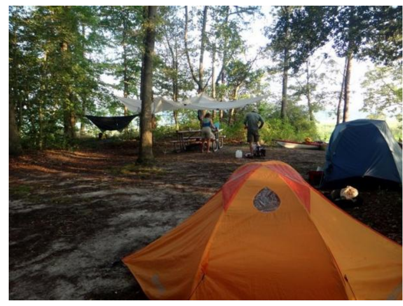
Campsite at Spice Creek

We pulled into another formidable and long-occupied site for lunch at Mount Calvert (river mile 44), just up the mouth of Western Branch (further up which is another paddle-in campsite). Mount Calvert is all that remains of another bustling colonial town established in 1684 (see <a href="http://www.pgparks.com/Things To Do/Nature/Mount Calvert Historical and Archaeological Park.htm">http://www.pgparks.com/Things To Do/Nature/Mount Calvert Historical and Archaeological Park.htm</a>). The house, built originally in the 1780s and added to in the 19<sup>th</sup> century, was substantially damaged in last year's earthquake and is undergoing extensive renovations. We lunched in the shade of large old trees down at the floating dock, then packed up and headed downriver again.