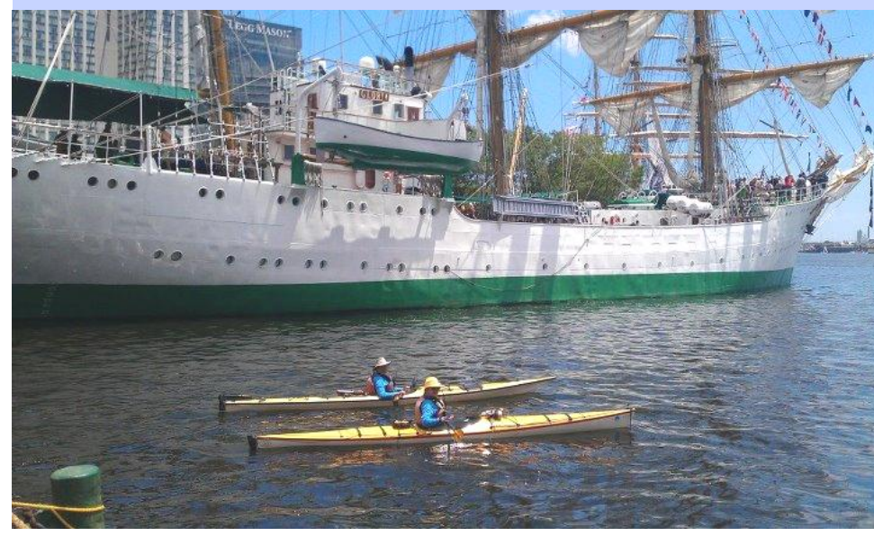
Sue and Rich Stevens paddle among the Tall Ships in the Star Spangled Celebration