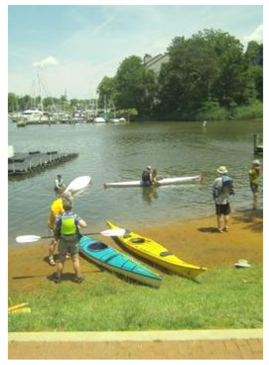
Gear Day and Fall-Out-of-Your-Boat-Day 2012, Truxtun Park

A 5% discount will be given for ads supplied as electronic files in acceptable formats (i.e. .tif, .gif, .jpeg, bit-map). Email or call for more information and for 10-month discount. See advertising contact in masthead.