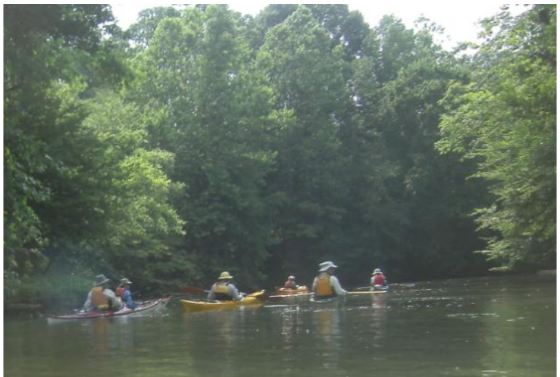
Heading down the Pax from Queen Anne Canoe Launch

The Patuxent is narrow and the current can be swift at the launch. It is very difficult to believe that Queen Anne was the official port of embarkation for the Pax in 1706, with ocean going ships making their way this far up the river. As the interior was settled and forests were cut for farm fields, silt clogged the once clear waters of the Patuxent and Queen Anne was gradually abandoned as a port. The last ocean-going ship left Queen Anne in 1790.