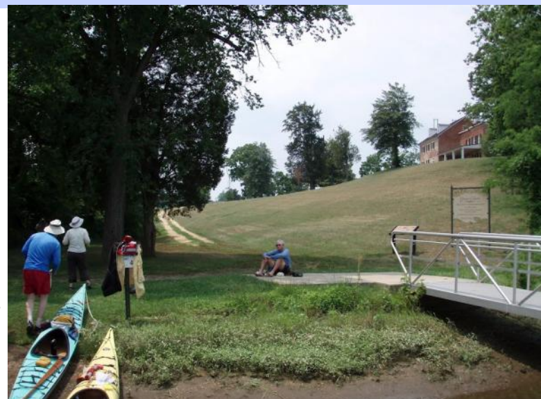
Lunch stop at Mount Calvert

We saw few boats of any kind until we reached the Route 4 (Hills) bridge. The Friday commuters were gone by now, and nobody was fishing off the platform beneath the bridge except the occasional Great Blue Heron. We passed Pig