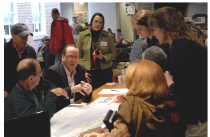
NPS officials review NMBZ Team 9 draft proposals during the NMBZ Feasibility Study Workshop. (Continued on page 6)

NPS then tasked each participant to discuss their ideas with their team and to write and illustrate their suggestions using marker pens onto a large drafting worksheet overlaying a map of the NMBZ Georgetown Waterfront area. The map defined the 5 proposed boathouse sites (Sites A-E, see above) under consideration, along with other NPS property. NPS made clear that they would not restrict anyone's suggestion or