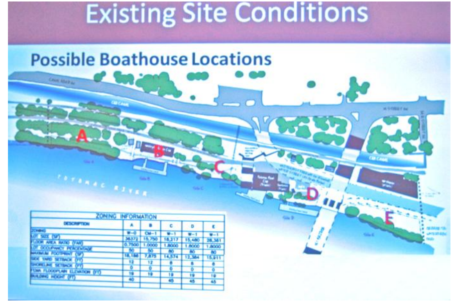
Illustratiive map of the proposed NPS-designated NMBZ sites (A-E)