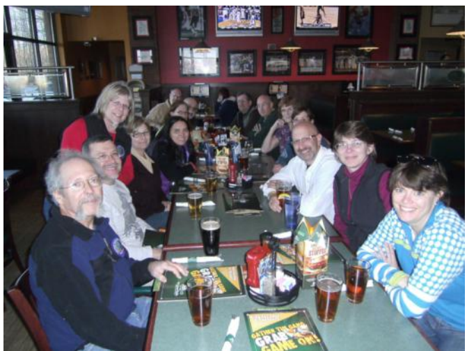
SK101 Staff at the Greene Turtle savoring the day