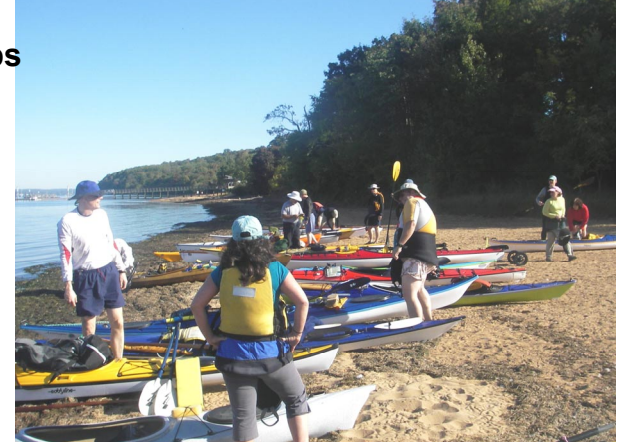
Elk Neck 2008, Led by Ralph Heimlich