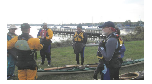
Annual Meeting Morning Paddle, 2007

Yes. It is time for the 2008 CPA Annual Meeting. This is the time that we review the events of the past year, and look forward to what the club plans for the year to come. At this meeting we will visit topics of concern for the direction of the club, but most importantly we will elect the CPA Steering Committee for 2009.