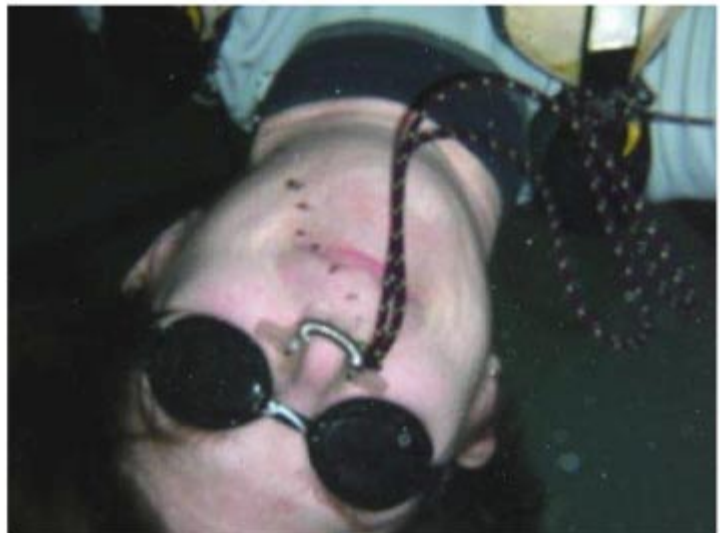
Upside down in her kayak...at the pool

For more information: Go to the CPA website at http://www.cpakayaker.com/pool.html And the discussion forum at http://www.cpakayaker.com/forums/viewforum.php?f=23 Which also has some info on pool sessions (mostly by WW kayakers) in Virginia.