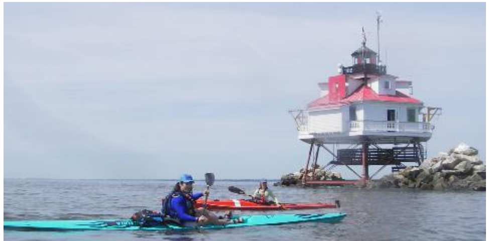
Saki and Cyndi at Thomas Point Light