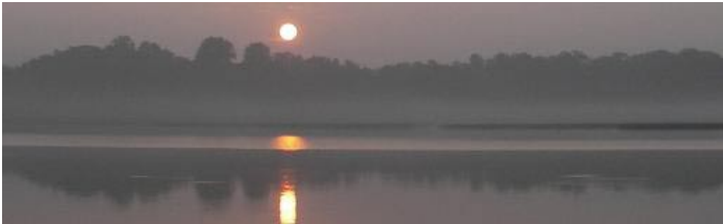
Patuxent Sunrise, August 2007