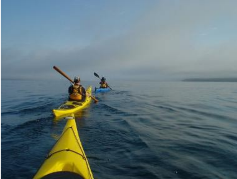
As we paddled the 7.5 miles due North the fog would move in and out