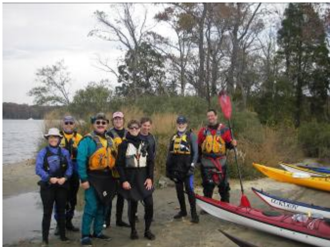
CPA Annual Meeting Paddle, November 6, 2007, Rhode River