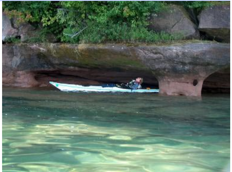
We played in the first 'sorta' sea caves we saw off of Point Detour on the mainland

In the end we only visited a few of the islands due the Superior's fickle nature. However we experienced some of the best the area had to offer – the sea caves of Devil's Island and Squaw Bay, the bald eagles and hiking trails of Oak Island, the crystal clear water, and the temperamental weather. All of this was topped off by wonderful paddling companions and some great food! I can't wait to go back to explore some more.