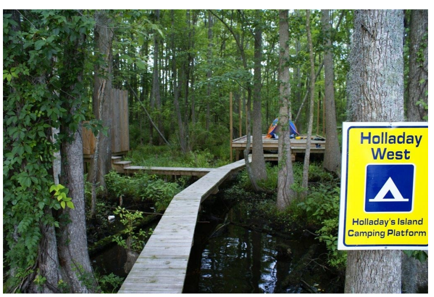
Hey chickee, have I got a campsite for you... (Continued on page 4)

vehicle overnight. I loaded up the Pisces while swatting mosquitoes and wondering if a mid-July camping trip in a swamp was a good idea bug-wise. It was an easy launch from the sand beach. The river is about 1.5 miles wide at this point with a long South/Northwest fetch, and I would imagine that in windy conditions there would be whitecaps out in the open. I took a leisurely 1 mile course to the south end of the island. Almost all of the river shoreline is cypress swamp, and from my position, the island also looked to be heavily forested in cypress. Arriving at the southern end, I paddled into the cypress and found the dock for the southern group campsite. These sites are made more for canoes than kayaks, with a wood step about 8 feet long being about 1 foot above the water, and then a loading platform about a foot or two above that. In a kayak, this means