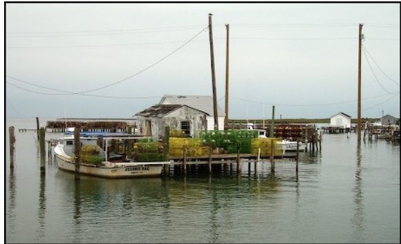
Tangier

This was my third trip to Tangier. Last summer I blogged about the second trip ... <u>"Island Hopping in the Chesapeake Bay."</u> It was such a fun trip that I couldn't wait to do it again.