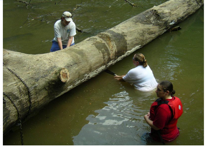
Two-woman underbucking

The next strainer we tackled involved several large tree trunks. The largest trunk had fallen from river right, but must have snapped off. It didn't extend all the way to the left bank, but several smaller logs had plugged the gap. The river bent to the right and the left bank was being eroded. Already one small tree protruded almost horizontally from the collapsed bank and had become involved in the strainer. Just downstream, a massive sycamore tree was anchoring the bank, but leaning well over the river. It would have been easy to clear the smaller logs at the left bank, but we decided to open a slot near the center of the channel and leave the left bank alone to help stall the collapse of the bank.