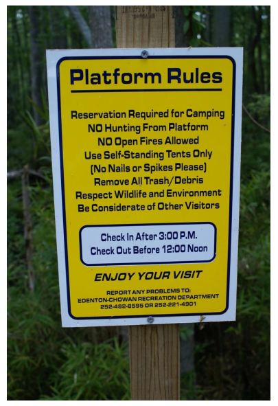
Rules of the Road

Completing the 3.5 mile circumnavigation, I backtracked to Holladay West and examined the landing platform. Some poking with the paddle revealed that there was a sand shoal along the back corner of the landing platform that was only about one foot underwater. I stood on this shoal while unloading the boat. Having platform camped from a kayak before, I figured out a way to prevent individual items from dropping overboard during the unloading. When loading the boat's front hatch, I took a line with several plastic clips strung on it. I tied one end of the line to the item that would go furthest up into the bow of the kayak, and then proceeded to clip the other items in the order they would go into the boat. This way, during the platform unloading and loading if I dropped an item into the water I would be able to retrieve it by the line. Better than watching your camp stove sink out of sight!