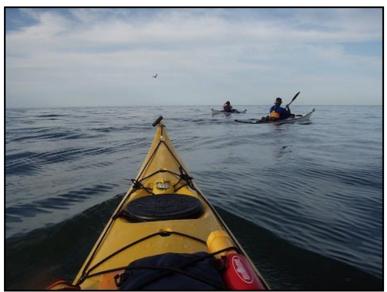
Underway photo by Shannon Bishop

The four mile paddle to Watts was quite different from the paddle over. The swells were 2-3 feet. Shannon said that I often disappeared between the swells. And at times they were breaking over the bow. But it was the wind which was the real challenge. By the time we got to the south end of Watts we were clearly struggling. Shannon and I