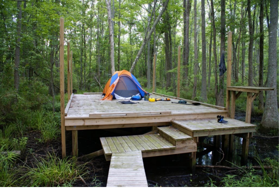
The camping platform

The Holladay West platform consisted of three platforms connected by wooden boardwalk. The first platform was the landing platform, and this connected to a boardwalk that ran back further into the swamp to the camping platform. The camping platform was about 16' x 24', with a toe rail and six vertical posts along the edge. The posts were about seven feet tall, with eye bolts on top. These would work well if you were looking to rig a tarp during rainy weather. The platform is also equipped with a wooden counter for doing your cooking (so you don't scorch the platform). Between the landing and camping platforms a short T takes you to a privacy screen that conceals a wooden thunder box (aka privy). This was somewhat unexpected, as the site instructions on the web indicated it was total Leave No Trace. Looking at the spiders, I decided my portable facility was a better choice! Since the camping is all on wooden platforms, a free standing tent that does not require staking is essential. In windy conditions, you could tie off the tent