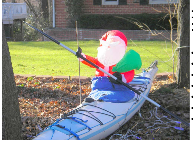
Kayak Santa