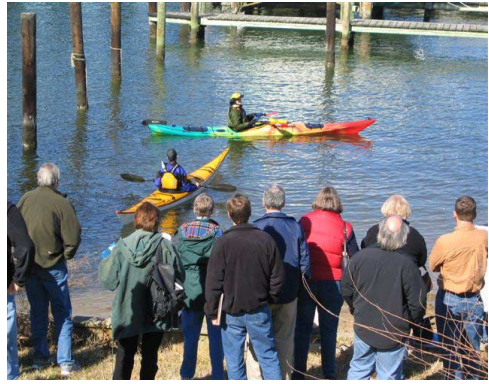
SK101 students observe strange sea creatures

So get the word out, invite your friends, neighbors and co-workers to sign up.