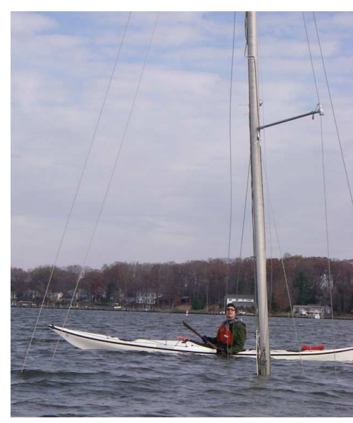
The one that never returned

Demo Days in 2007 —Many local retailers schedule kayak demonstration days in the May-June timeframe. The CPA has traditionally provided support to a number of these demo days, with on-water safety boaters and to man tables to provide information about the CPA. Dave recommended if we learn of vendors who need support at their demo days to contact the Steering Committee. We are always looking for volunteers to provide on-water support / water safety or represent CPA and give out membership info.