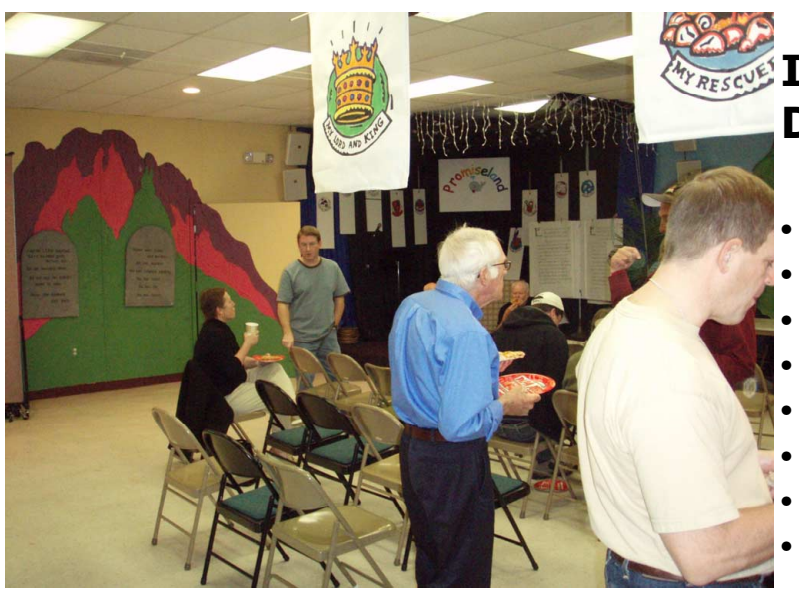
CPA Annual Meeting, November 19, 2006, Cedar Grove United Methodist Church, Deale, MD