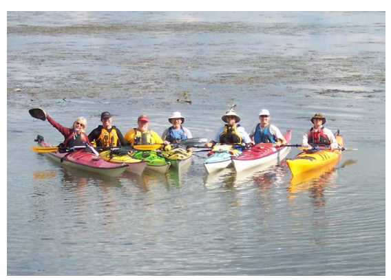
Sunday Paddlers, Elk Neck 2006