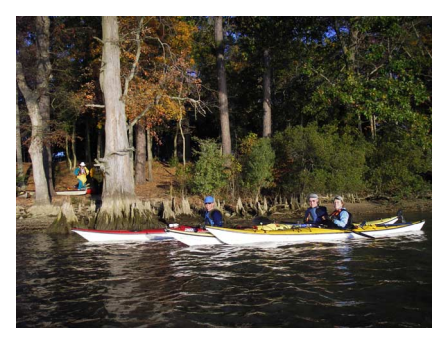
Chickahominy Paddle

Public service announcement and personal ads to sell kayaks/ accessories are printed at no charge; non-members pay $10 for 3 months.