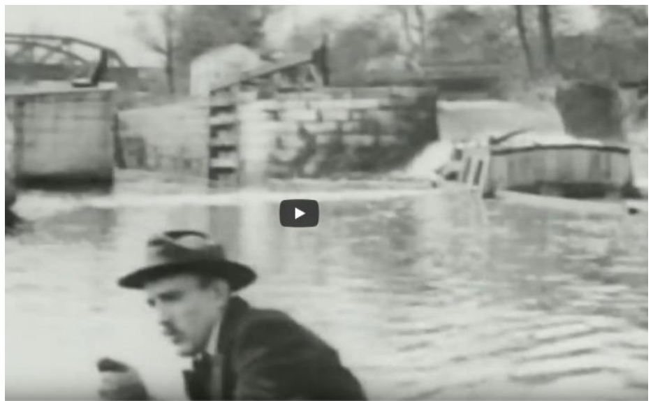
A Thomas Edison film from 1917 shows what a trip from Cumberland, MD to Washington, DC on the C&O Canal was like.

The video is courtesy of the Lovettsville Historical Society and Museum .