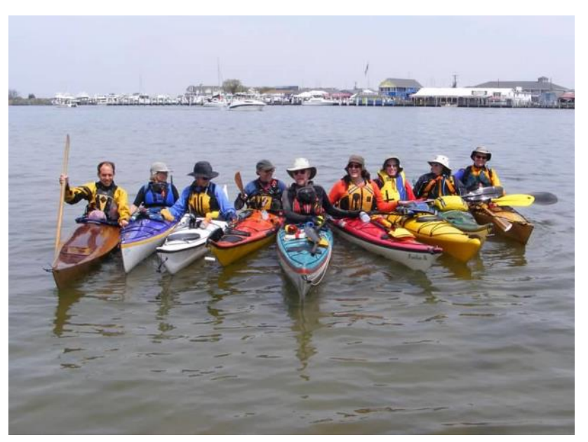
Building friendships through shared paddling experiences, fostering education and coming away with a lasting sense of accomplishment are the hallmarks of the KIP series.

"Out of these adventures and the KIP series one doesn't need to do them to prove anything, it is not for everyone. What I have found from a lot of the paddlers that did the KIP series is they went back to paddling they liked, whether it was soft paddling going up creeks, rivers, bays or oceans. It doesn't matter, they went back with more skills, confidence and safety to enjoy our sport.