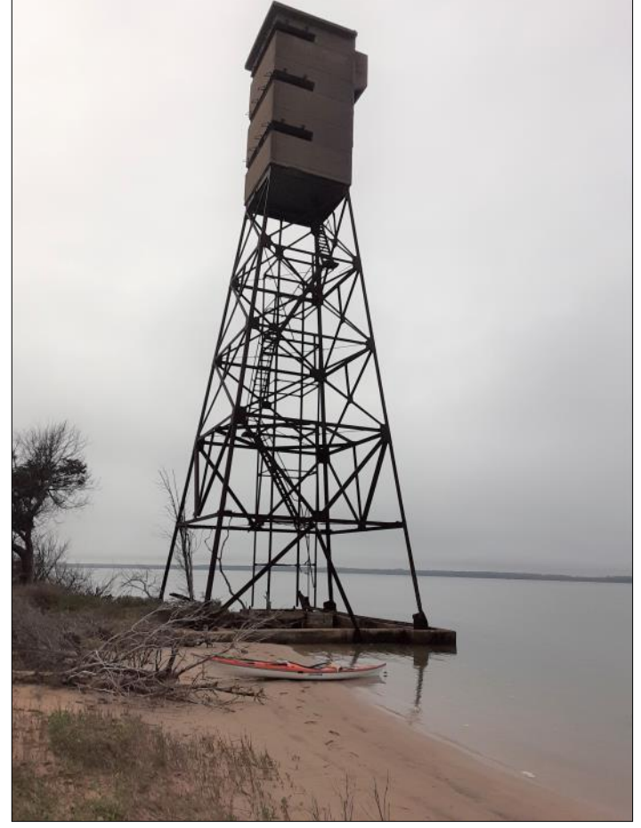
Military towers from WWII on Mockhorn Island make a good destination from the launch at Wise Point.

day so no more trips were possible on that visit. Besides a large rainstorm, high winds made Magothy Bay look like a washing machine. A couple weeks later I was able to return to get in two paddles to Mockhorn Island and Smith Island. This second visit, I had a rare light and variable wind both days.