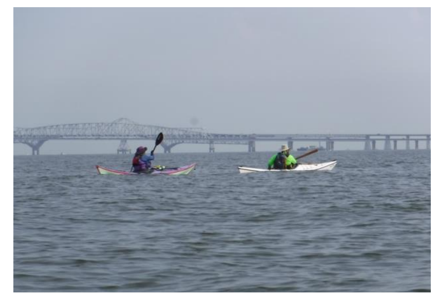
The Chesapeake Bay Bridge is a familiar landmark during practice paddles and the final trip around Kent island.

guarantee is you become a better, more aware paddler.