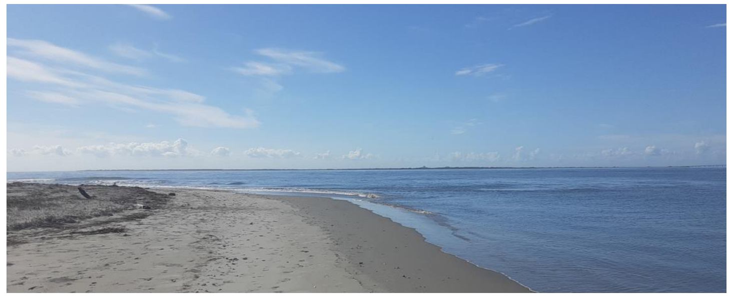
Looking across Cape Charles Inlet from Smith Island at the mouth of the Chesapeake Bay. The area is part of Virginia's Barrier Islands with miles of deserted Atlantic beaches and inland bays for numerous paddling opportunities.