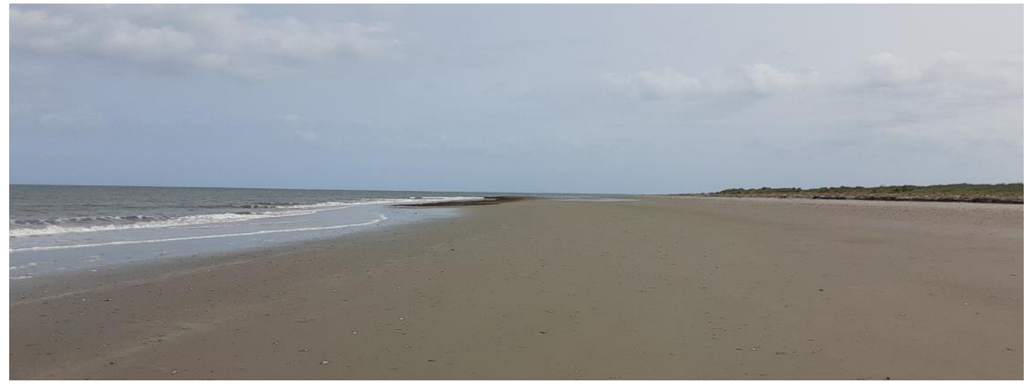
Pristine Atlantic beaches await on Wreck Island and other Barrier Islands on Virginia's Eastern Shore.

hunting lodge. You can land on the beach near it at max high tide, but at any other time it's a maze of rocks and concrete. Also, just before the towers there is a gut that gets you into the interior of Mockhorn Island for exploration.