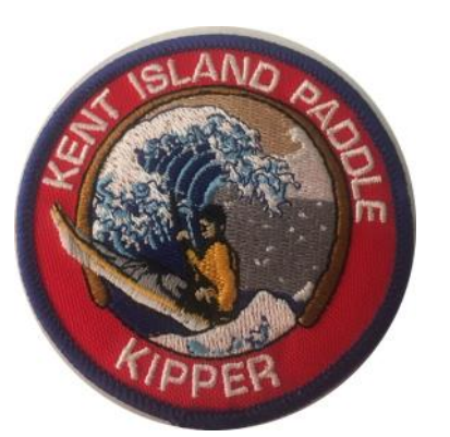
The KIP patch is worn with pride by many CPA members who complete the KIP series, including a 34-mile circumnavigation of Kent Island.

"One big thing that happened that we were not expecting. By coming back year after year you grow, build confidence, leadership skills and all of a sudden CPA had new trip leaders! Who knew? Don't get me wrong, not everyone wants to be a trip leader, but one thing I