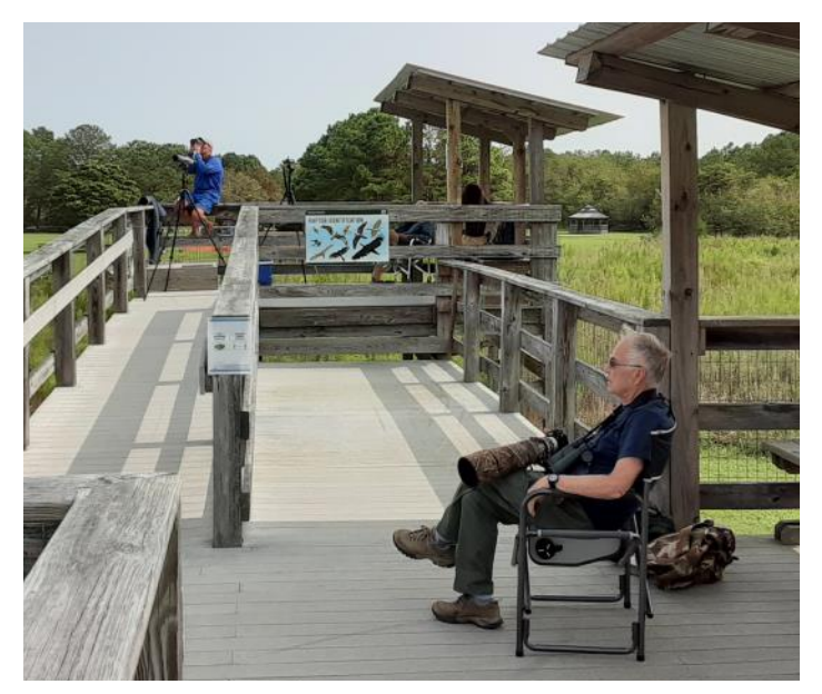
If the winds are high, watching migrating raptors is an option during the fall at Kiptopeake State Park.

Photos: https://photos.app.goo.gl/ahEV9gSdAQZ7XoWt8