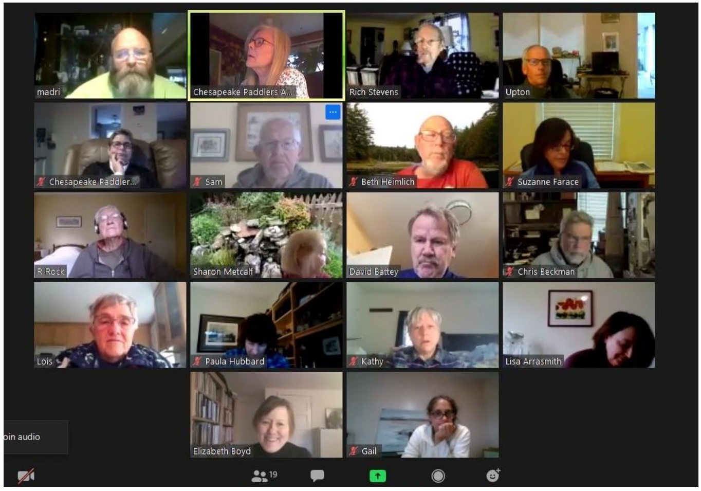
Like many other organizations in the age of COVID-19, the CPA Annual Meeting took place via ZOOM.