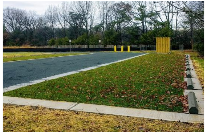
A new parking lot expands public access, but be sure to get the gate access code before you visit.

Boat access was difficult for those who don't live in a waterfront neighborhood. Paddling here is very weather-dependent since the shore is exposed. Overall, Jack Creek Park is a great natural asset for the residents of Anne Arundel County.