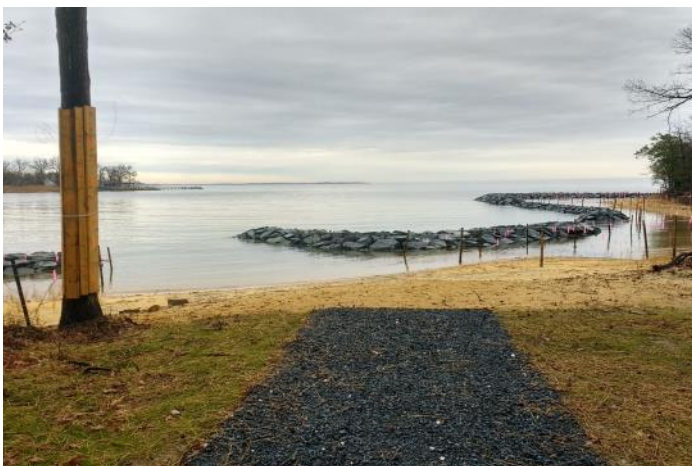
Park improvements included repairs to the access trail, beach protection and a new kayak launch.

By 2018, the island had split in half, and on at least one stormy day in 2019, and again in April 2020, it was underwater. Meanwhile, waves had chewed at the park's shore and the forest.