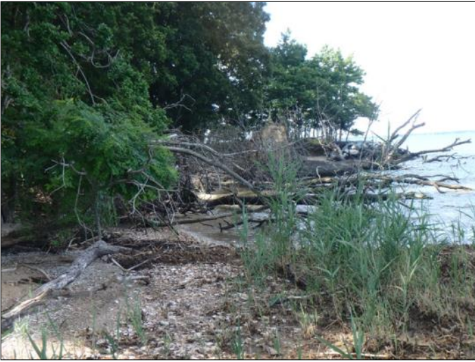
In 2018, Anne Arundel County embarked on a restoration effort to repair the damaged beach and access trail.

feet deep. For several years, I enjoyed swimming out to the island from the beach.