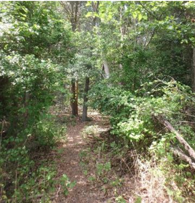
Prior beach access was via a rough half-mile trail.

For many years, access to the park was difficult. It was