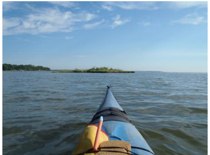
In the early 2000's, the original shoreline was severed to form a small island.

In 2003, on my first paddle to work, the park had a peninsula sticking out into the Bay. After a while it got severed by a channel. At first it was a tight and shallow squeeze for my kayak, but soon it got wide and several