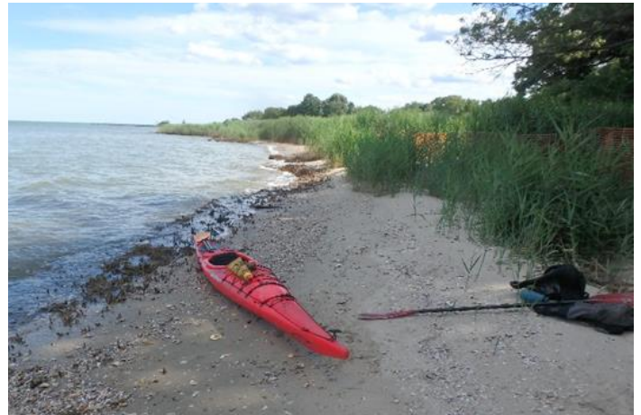
Jack Creek Park shoreline in days past before the effects of wind and waves.

either by boat or a half-mile walk to the water. The park has gone through many changes, from the erosive effects of rising sea levels to new construction to mitigate those effects and allow easier access to a new a canoe/kayak launch.