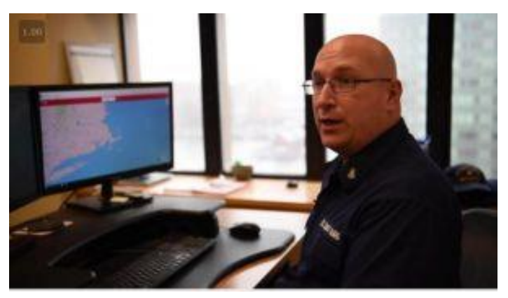
A demonstration of how the Coast Guard uses the i911 system in Boston, Massachusetts.

The Coast Guard is expanding the use of a new i911 service to allow faster location for a rescue. The i911 program allows Coast Guard rescue crews to use your smart phone number to pinpoint your location.