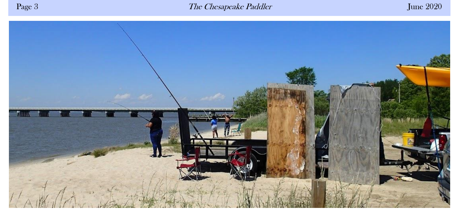
On the return, more people showed up at the launch where Ralph and Bela donned their masks and loaded up their boats.