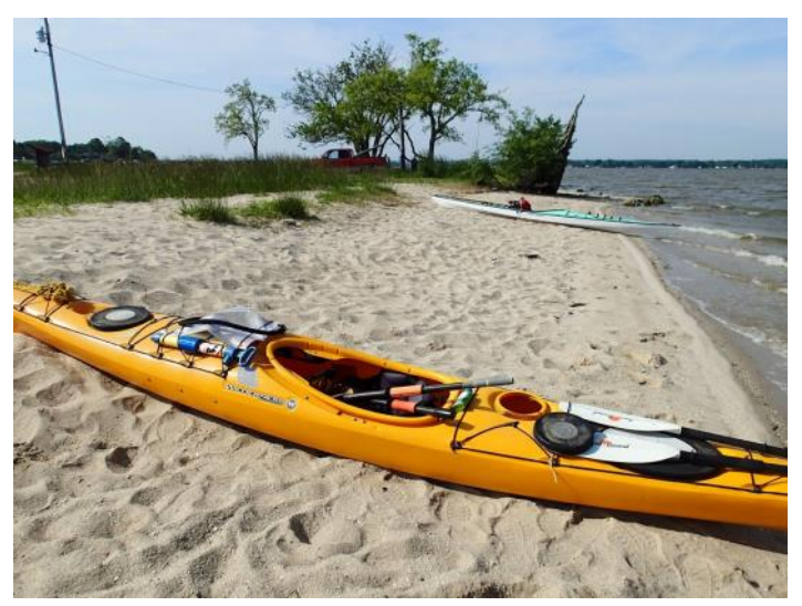
Ralph and Bela practice proper social distancing at the Hallowing Point launch site.

Most experts agree that there is less risk of COVID-19 transmission in properly distanced outdoor activity