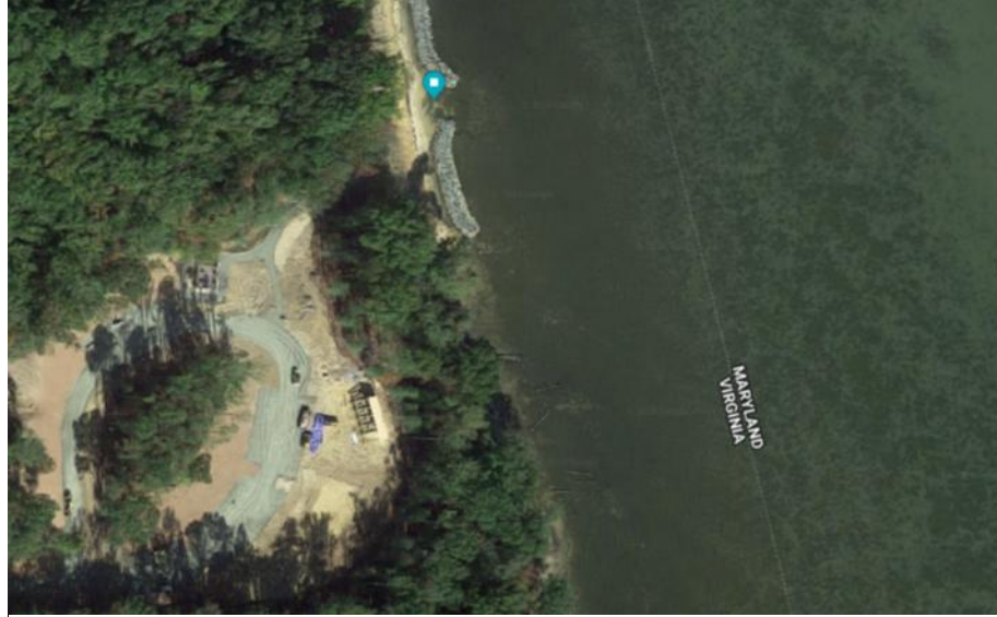
This is the paddle-in campsite on the Potomac River, just above the mouth of Aquia Creek. This site shares a full restroom with the picnic area and has running water available. A second campsite is planned farther up river in the park for a later date. The SP also has a kayak launch on Aquia Creek.

http://www.cpakayaker.com/chesapeake-bay-access-and-paddle-in-campsite-