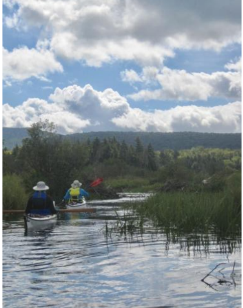
The meandering Cedar River

Stevens had scouted the route the week before and were able to direct our searches to approximately the right area. Even then, we had a bit of trial and error before finding the creek. Not as if paddling around the marsh grasses was wasted time, though; it was beautiful.