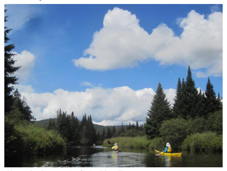
Mountain views on the Cedar River Flow

Starting out on the lake formed by the dam, we see mountains surrounding the lake, giving perspective as well as a scenic backdrop, and equally scenic islands, creating an interesting paddle path. The CPA Loons check out the avian loons and vice versa. We saw an adult with a juvenile riding on back as they do earlier in the summer. It struck me as getting rather late in the season for the young one to be at that stage of development. It's going to have to be able to fly in about a month, or it will miss the last flight out, as it were.