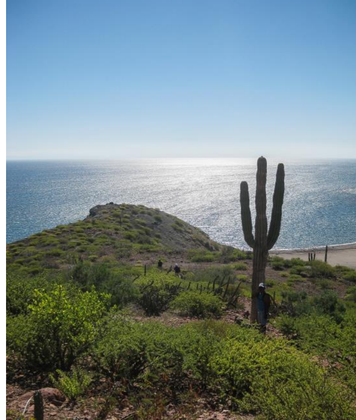
View from a hike above last campsite.

Our trip was run by the Mexican outfitter Paddling South in partnership with California-based Seatrek. They offer this itinerary from Loreto to La Paz, ten days of paddling and primitive camping along a very sparsely populated and largely inaccessible stretch of coastline, only twice in a paddling season, which runs from late