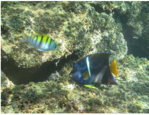
Sergeant major and Baja angelfish.