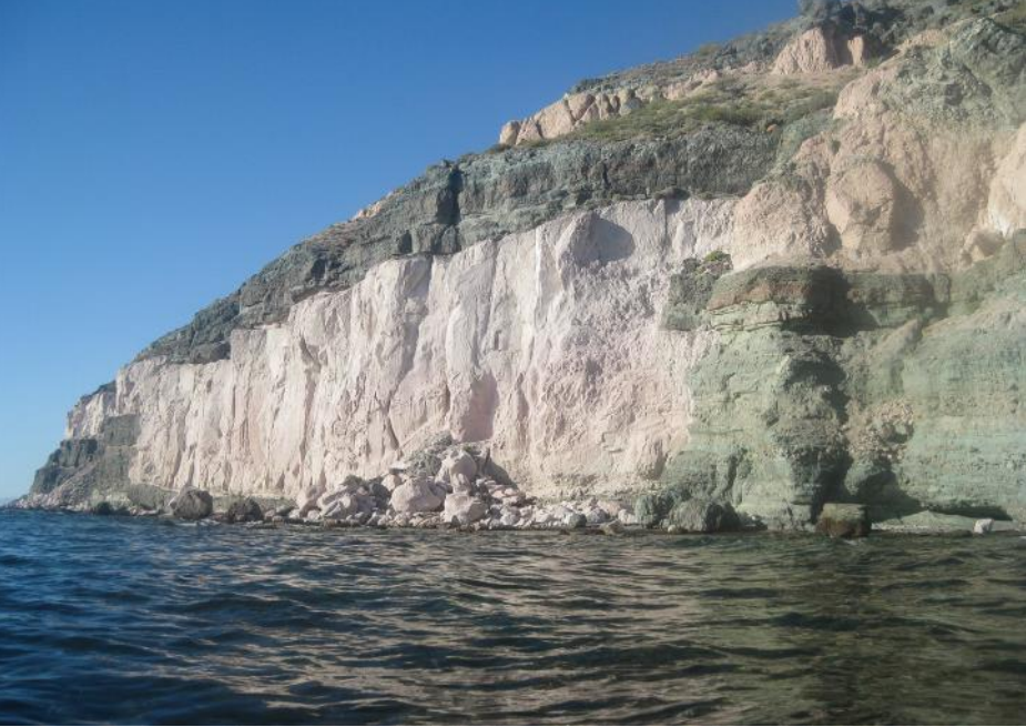
A colorful cliff face.

the edge of the beach littered with dead palm fronds, another a small